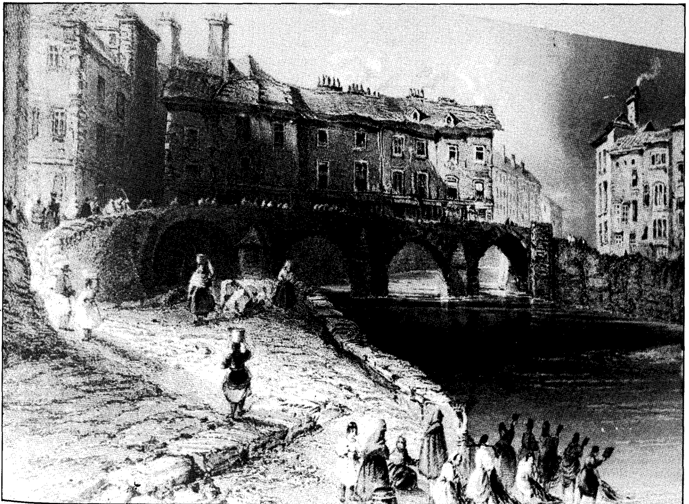
Old Baal's Bridge, the location of one of the first printing works in Limerick.