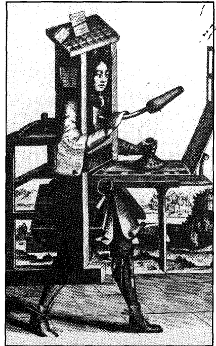
A seventeenth century perambulating press.

Limerick at that time did not form an active political centre in the sense that the other-mentioned cities did. When the garrison fell into the hands of the Irish, in June, 1642, the citizens closed their gates to Royalists and Parliamentarians, carried on their trade at sea, and remained steadfast to Catholic and Gaelic principles until the miserable surrender-if not actual betrayal-of the city to Ireton in Oct., 1651. Like effects are produced by corresponding causes, and those circumstances go far to account for the absence of a press there before 1650 ... The period of the revolution (1688-9) witnessed a change in the position of Limerick. The city was at that time the most important, politically, in the South of Ireland, and the tide of war rolled hotly round its walls to the very last, so much so, that it was the last sod of Ireland that resisted the new regime. Tyrconnell, too, after the defeat of the