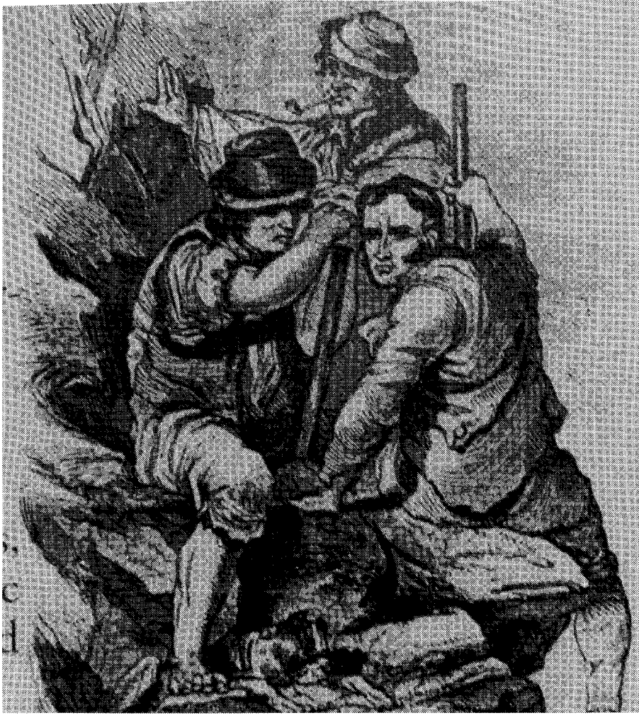
Three armed men lie in wait. Engraving, Historic Times , 1 June, 1849.

those who existed on the margin of Irish society are considered, it leaves one to wonder what the actual rates of mortality were during the famine years from 1845, through 1848, to 1853, the year British parliamentary papers record the famine as having ended.