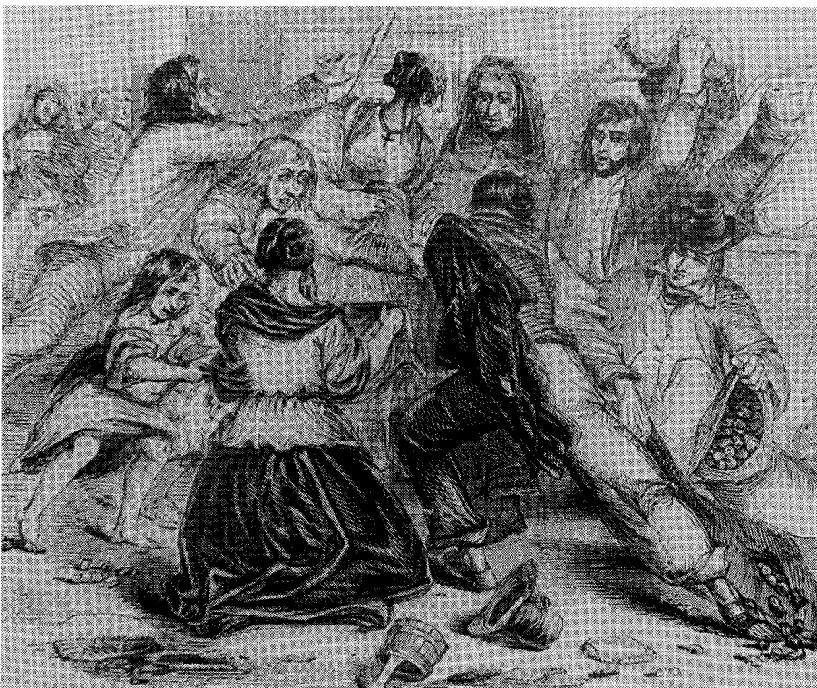
'Attack on potato store'. Engraving from the Illustrated London News .

It is recorded that the population increase for the time was 5% per decade; it is likely then, by 1845 and 1846, as the famine took hold, that the population was considerably higher than the number recorded in the June, 1841 census. When