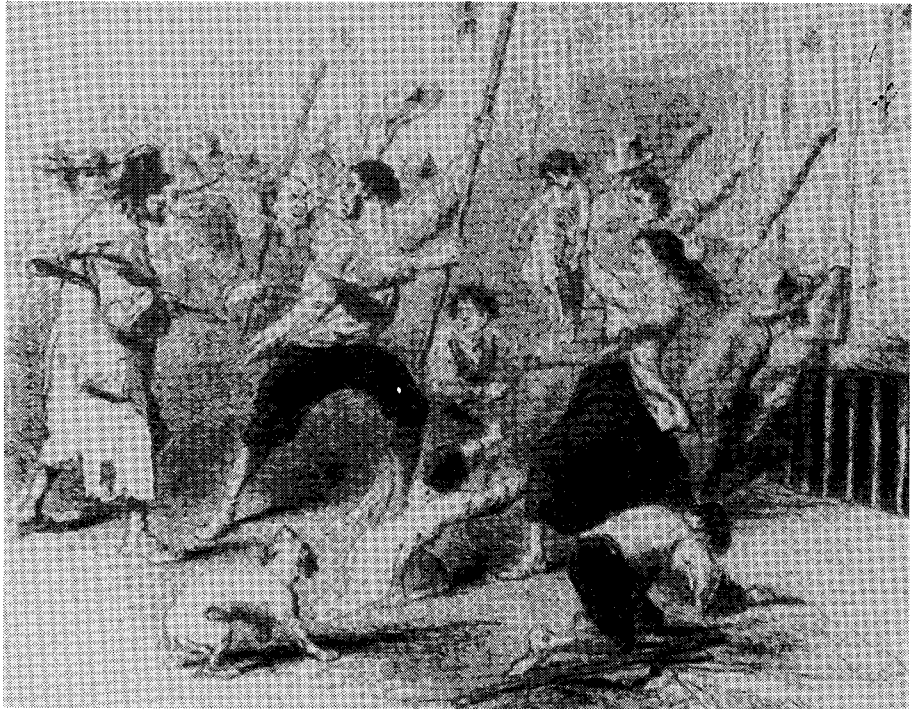
A food riot. Engraving, Pictorial Times , 10 October, 1846.

Figures show that wage-earners, or breadwinners, numbered 19,454 people, including 683 below 15 years of age. There were 28,937 others, 15,908 children below