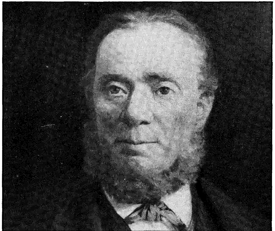
Michael Hogan, the Bard of Thomond.