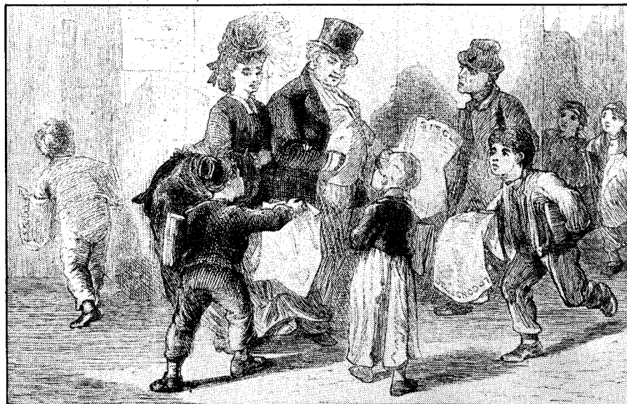
Spreading the news in Paris.

an Arcadian simplicity that reminds me a little of Puvis. (14) (de Chavannes).