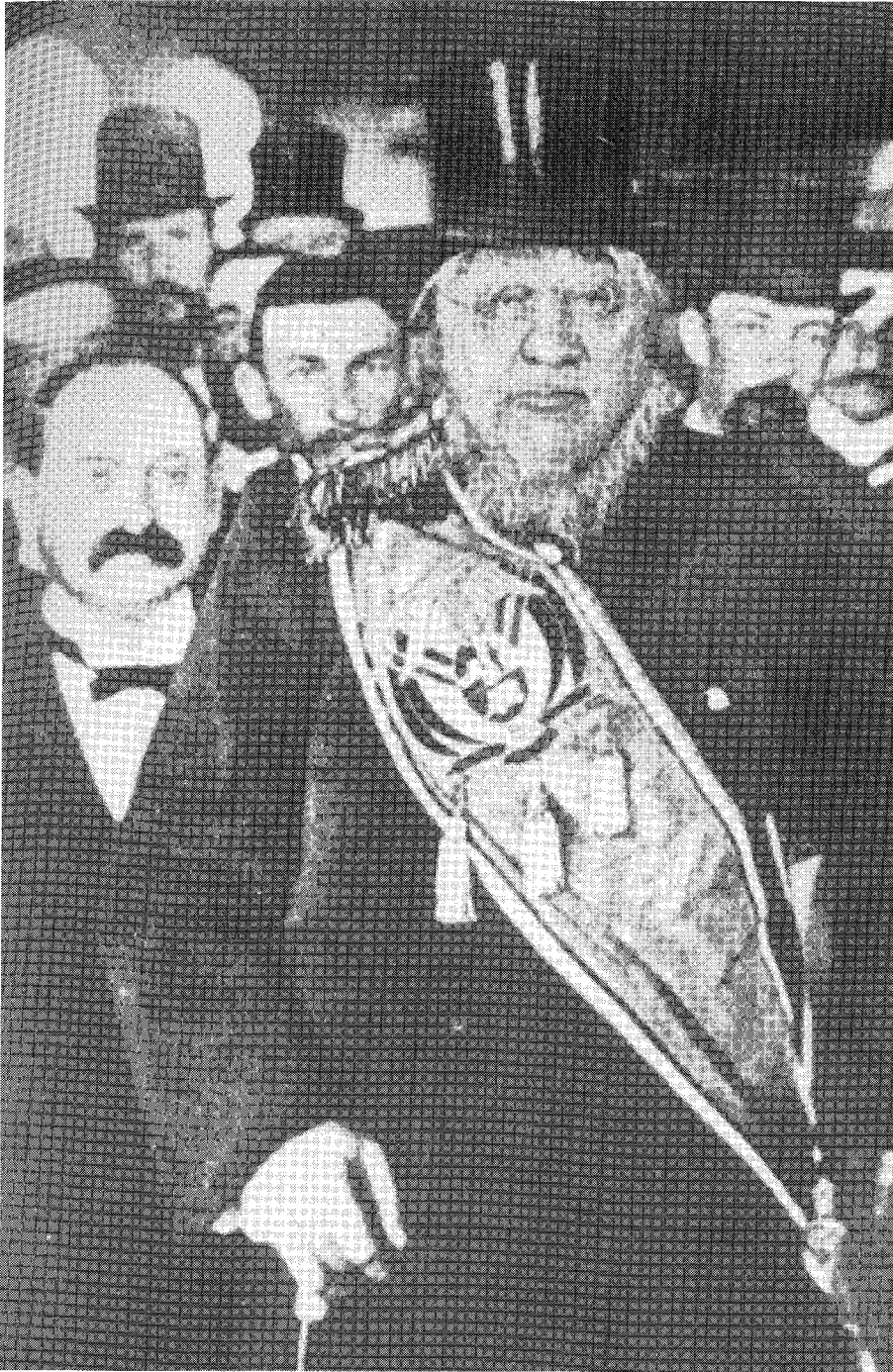
President Kruger and his advisers.

of the hostilities, the railway lines were vital to the British due to the fact that soldiers could be moved more quickly, or so they thought.