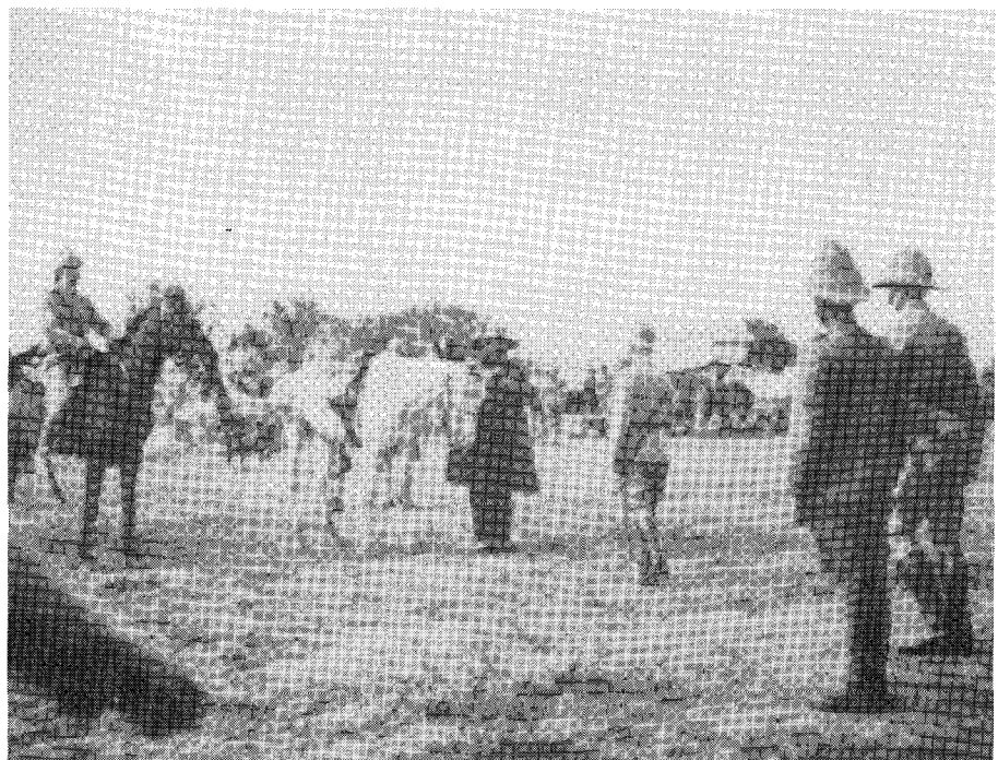
Cronje surrenders to Roberts.

In early April, the departure of over 100 men of the 7th Batt. Munster Fusiliers (County Militia Reserve) from Limerick railway station created heart-breaking and, at times, comical scenes, as they marched