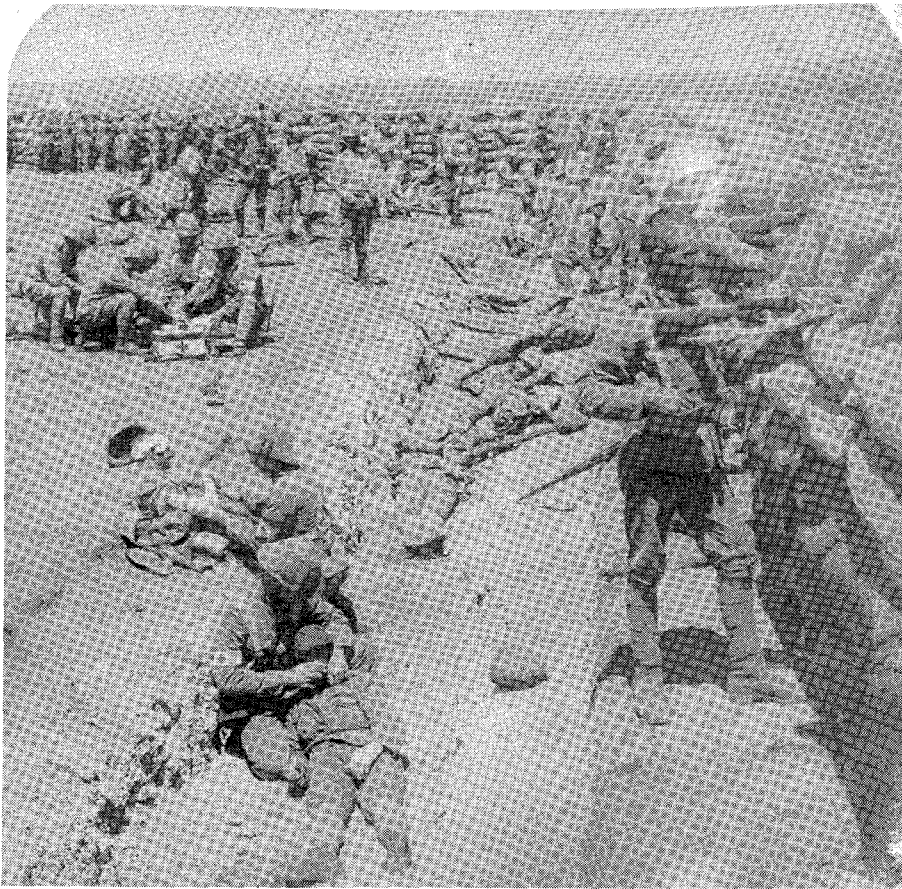
Royal Munster Fusiliers fighting at Honey Nest Kloof, 16 February 1900. Note the dead and wounded soldiers in the trench.