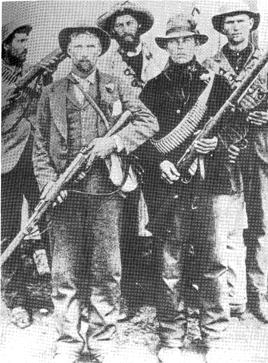
Some fighting Boers.

becomes scarce we can stay just the same as the Burghers that are fighting for the country, and trying to keep the blood suckers from it. I prayed when the war commenced that they would do so, and they have done it so far and more success to them. The Boers are honest and upright people which can't be said for the other side. At present they are fighting very hard, there have been four very heavy battles, in which the Boers have been victorious every time. England lost 9,000 men up to the present, and will lose them all if she don't give up in time, and go fight Kaffirs and Dervishes, not her superiors. I hope none of the fellows around your place have joined the army for if they come out here they come to die, not to live.