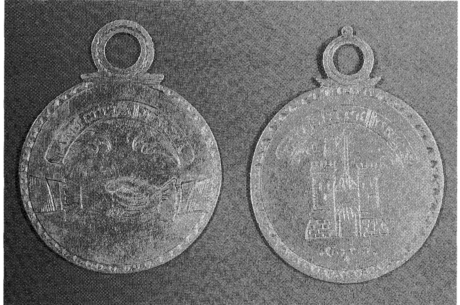
Silver medals of Thomas Smyth's Limerick Union, 1776.

Despite the augmentation of the standing army and the establishment of the militia in 1793, the government in Ireland thought these inadequate for the proper defence of the country against invasion or rebellion. From 1794 volunteer units were established in England, and these, rather than the old Irish Volunteers, as Grattan urged, formed the model for the new volunteer force instituted towards the end of 1796. The units were raised by local magnates, but armed by the government. When on active service they became a semi-permanent local police force and occasional military auxiliary. By November 1796 the force consisted of