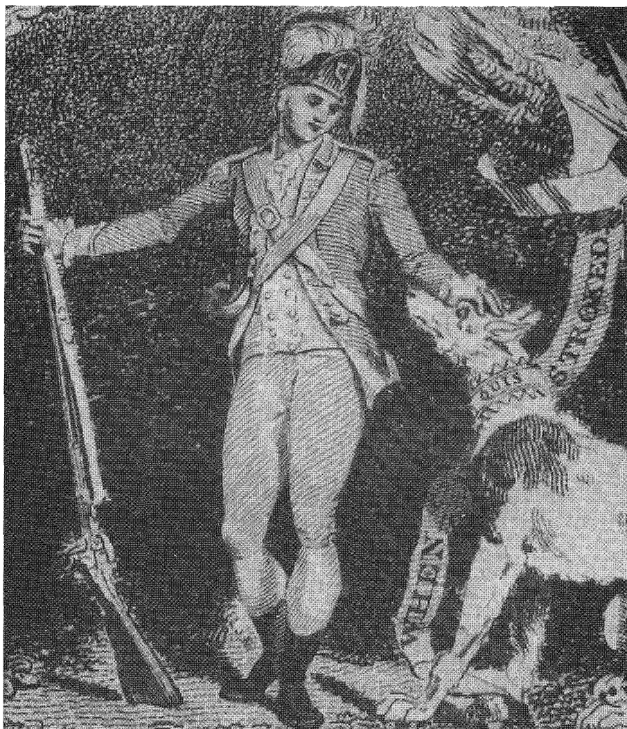
Irish Volunteer in Light Infantry Uniform, from a decoration on a contemporary lottery ticket.

were invited to join the Limerick Independents.