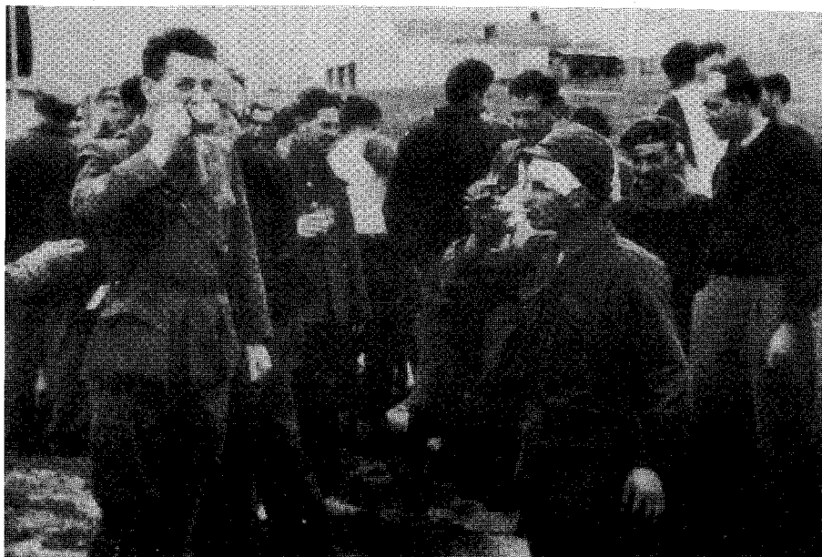
'Time Out' from the front lines, Spain 1937.