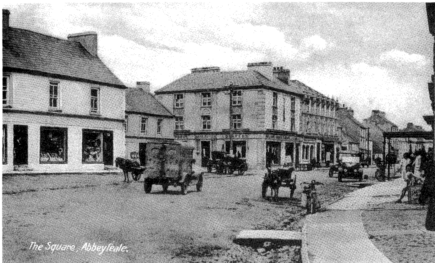
1930s Milton postcard showing the Square, Abbeyfeale