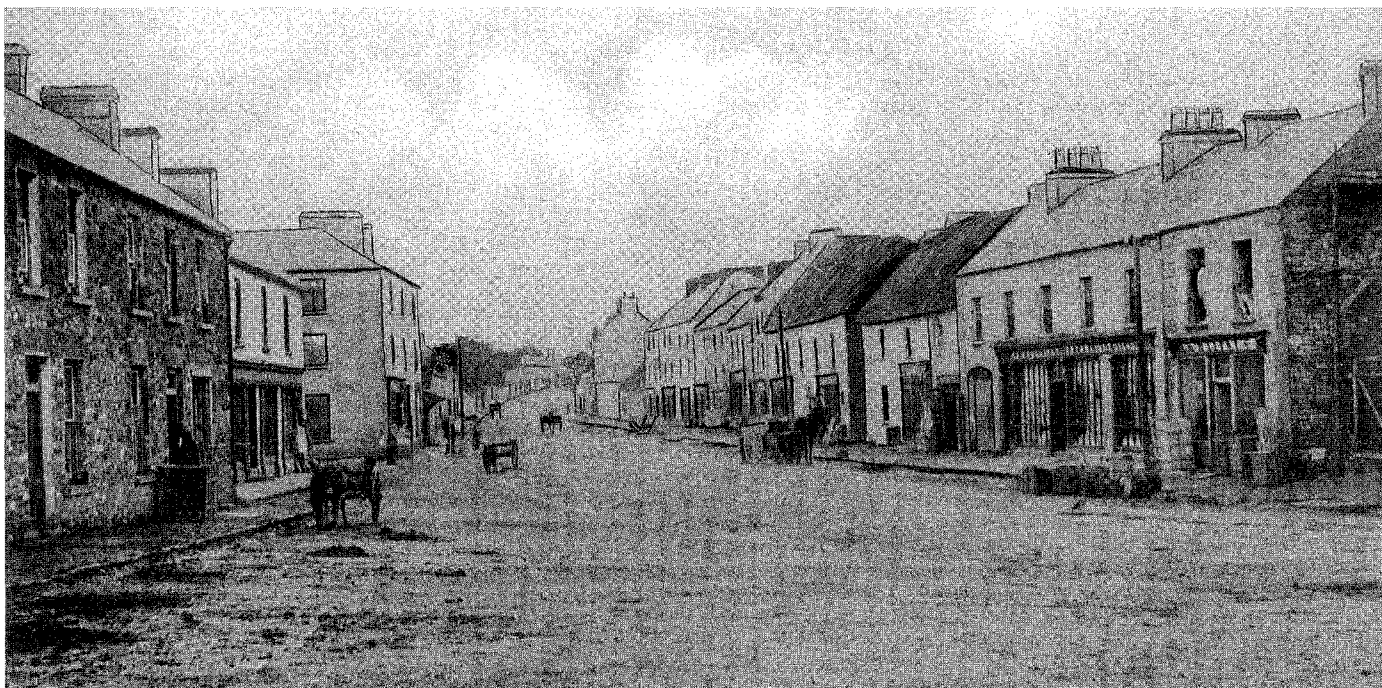
Main Street, Abbeyfeale, postcard by Hely's Ltd., Dublin, c.1910

We also had what were known as gambles in my native Knocknagoshel. The people of the house would raffle something like a greyhound pup, or a bonham,