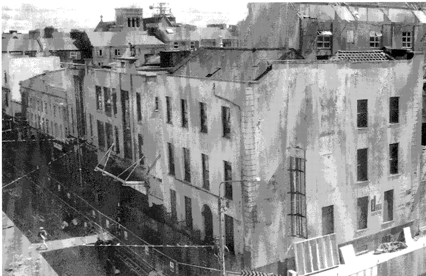
View of hospital building before demolition, 2006

Services were expanded by 1898, when an extern dispensary was set up in the hospital for the treatment of ‘diseases peculiar to women’; the Child Welfare Committee also operated a clinic for children from the basement of the hospital and a training centre for midwives was set up at the end of the nineteenth century.