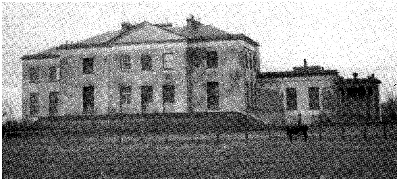
Ballynagarde. 1950s