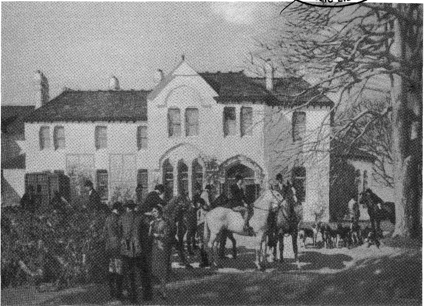
The Lawn Meet, Co. Limerick, print after a painting by Patrick Hennessy (1915-1980)