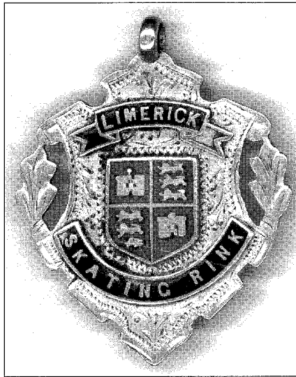
Gold medal of Limerick Skating Rink, 1910 (Limerick Museum)

I was detailed to take charge of a dozen cavalymen and was allotted my own little side street. We waited for some three or four hours before the procession as such, or what was left of it, seemed to be approaching our way. It is difficult to describe the noises that filled the air up to that time. We could not see down the main street, but we could hear the smashing of glass windows and the rattling of stones could be easily made out. And then came our surprise. Suddenly our little side street became full of men and women, rushing towards the main street, no doubt to obtain further points of advantage. I can see the women now, holding their petticoats up with both hands, in which the munitions of war in the shape of road metal were being carried, and from which the men helped themselves as they wanted. They came straight at us. What could twelve men do on horseback against such a rush? They were on us, round us, through us, before we could get our breath. I suddenly felt one of my feet had been taken out of the stirrup-iron, and the next thing was that I was pulled out of my saddle and fell, to my surprise, on something comparatively soft. It happened to be a lady who was paying me this delicate attention, and I fell on her, she sat down on the ground, dropped her