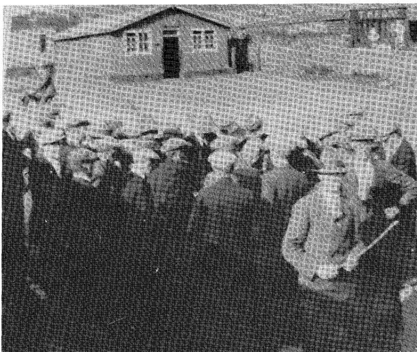
A tossing "school" at the Pike, circa 1935.

A dispersal of the railway corner boys occurred in the 'fifties when some unusually-dressed young men appeared on the scene. Wearing tight drainpipe trousers and with wavy, oily hair, the strangers were known as Teddy boys. As the disturbed corner