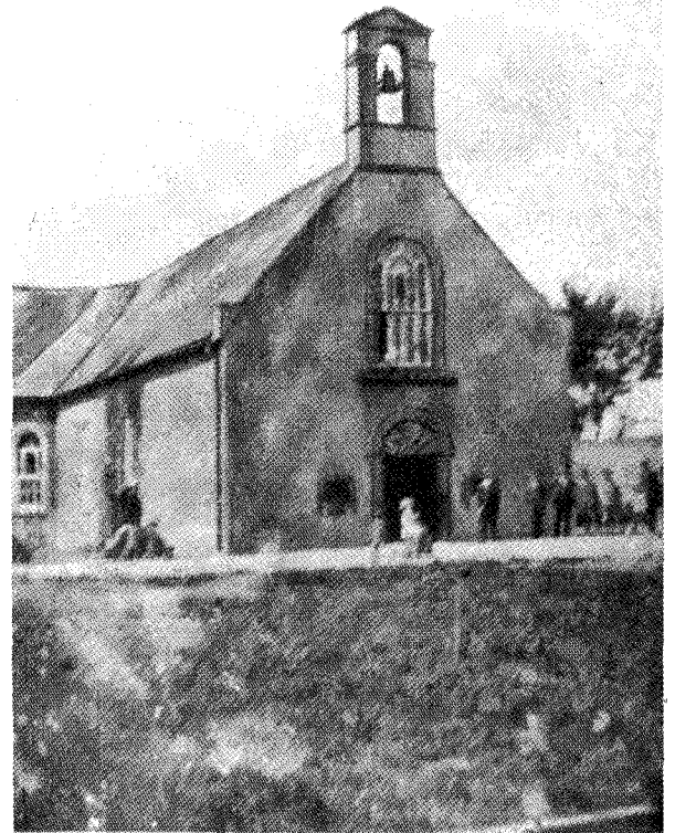
The Old St. Mary's Catholic Church.