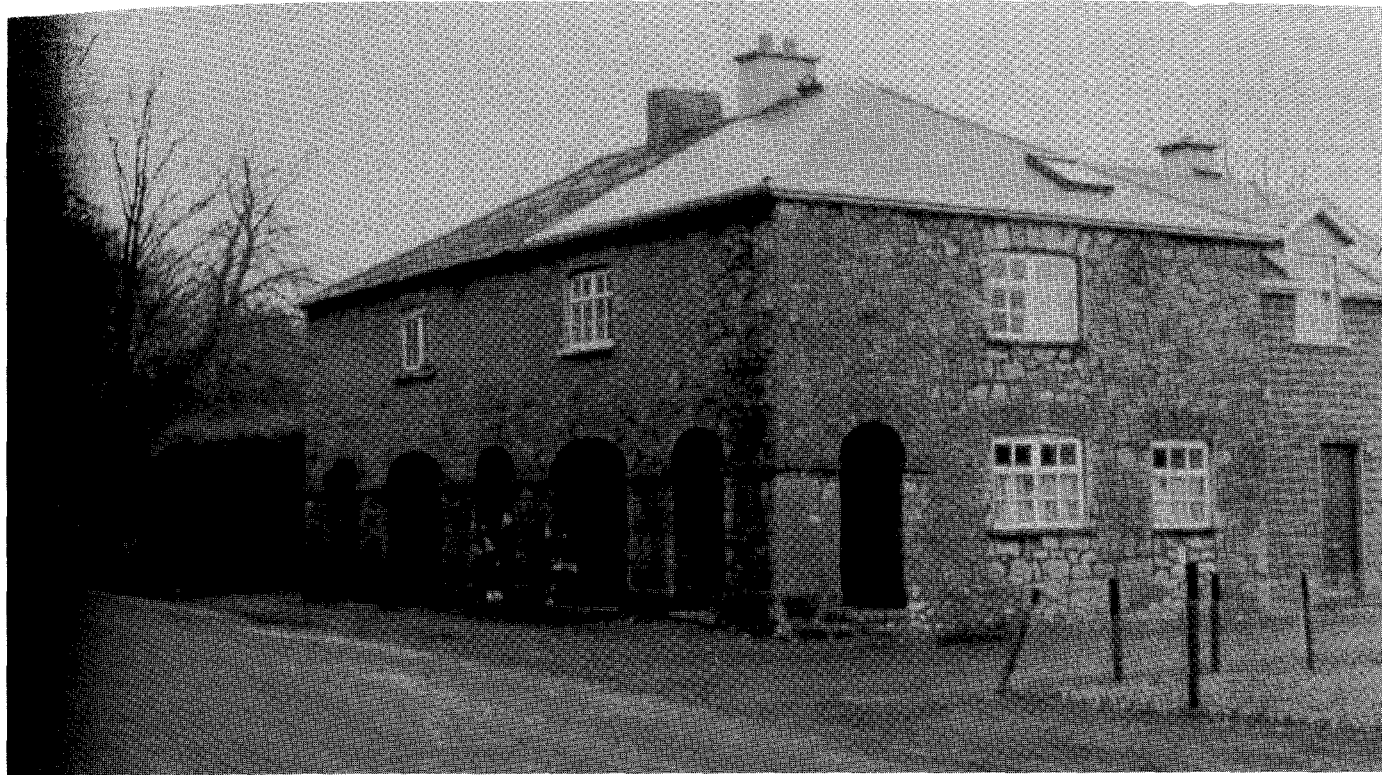
Ahane School in February, 1992.