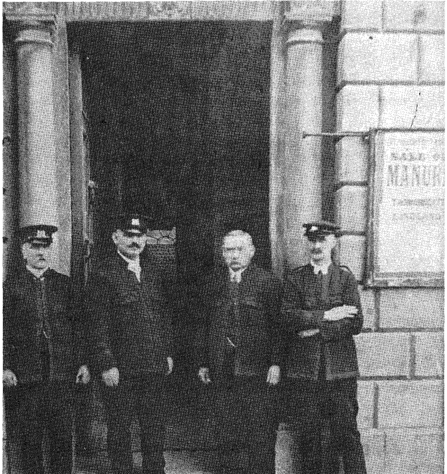
Four Corporation workers in the early years of this century.

plied the same system to Ireland in 1838, even though there was no tradition of parish government in Ireland and no parish areas existing here. It was to be an act "for the more effectual relief of the Poor in Ireland". The real object, however, was not so much to mitigate the sufferings of the poor as to prevent them from going over to England. The problems of poverty in England and Ireland were totally different. The immense amount of destitution in Ireland would have involved huge expenditure if the Poor Law was to be really effective, but the British Government had decided that property in Ireland must support the poverty in Ireland and so shift the burden from England.