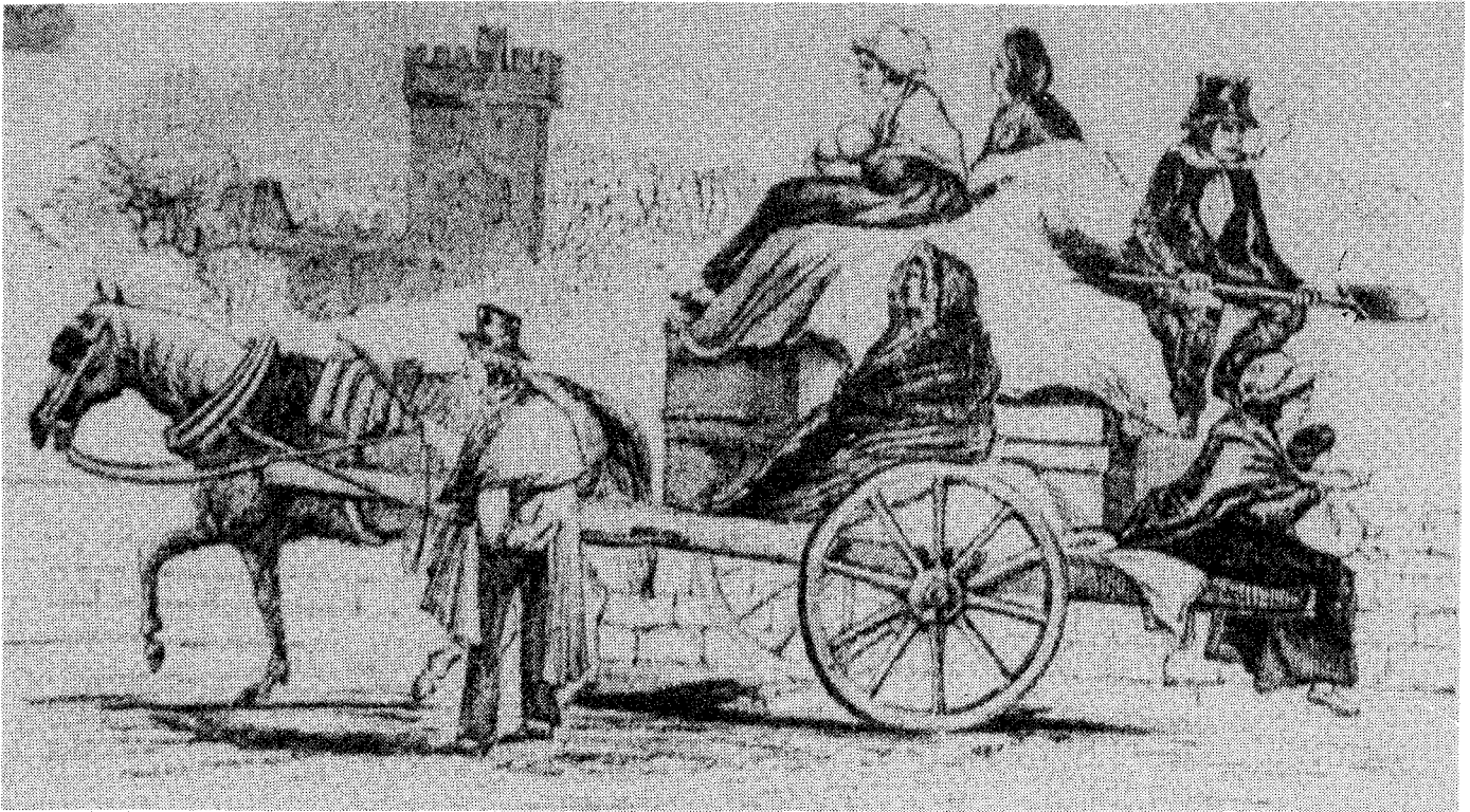
Emigrants on their way to Cork. Engraving, Historic Times , 2 March, 1849.

unfortunates to send the death toll soaring. In the week ended 20 March, 1847, there were 72 deaths and the weekly total was rapidly increasing all the time. By April, it had reached the fearful peak of 108 deaths, an average of 15 a day. In all 4,000 people died in the Limerick Workhouse between 1847 and 1849.