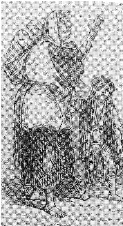
A mother cries out for food to feed her hungry children.

We are reliably informed that the state of Killeely cemetery calls for immediate attention at the hands of those whose