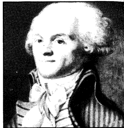
Maximilien Robespierre (1758-94), future leader of the Committee of Public Safety.

General, the equivalent of our Parliament, to devise new ways of raising money. It had not met for nearly two hundred years, not since 1614. When it met again on 5 May, 1789, Louis XVI was still ostensibly supreme.