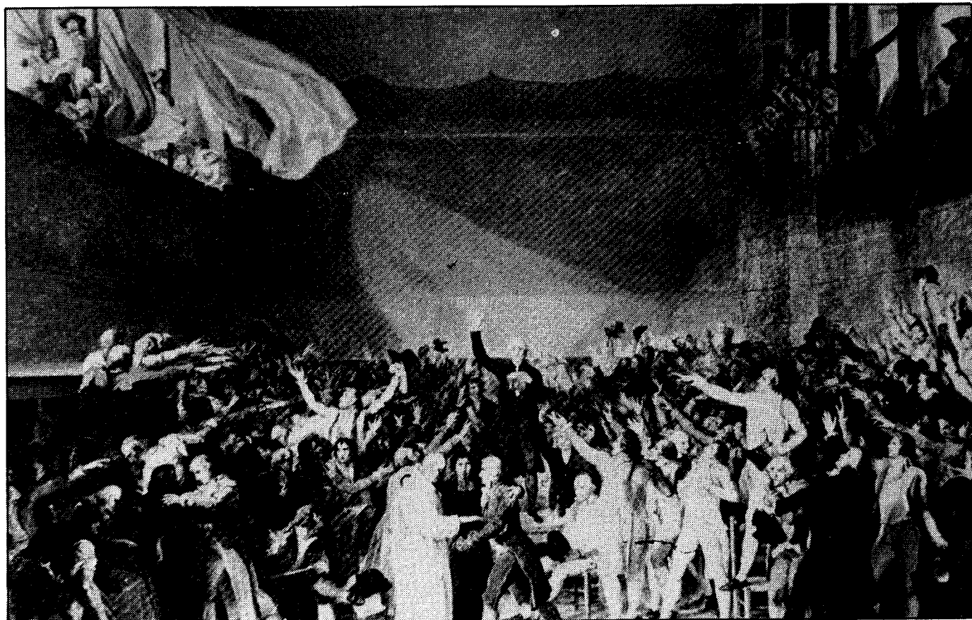
The Tennis Club Oath.

Within a few weeks Louis XVI grew uneasy. He was afraid that the Estate General, already calling itself the National Assembly, would encroach on