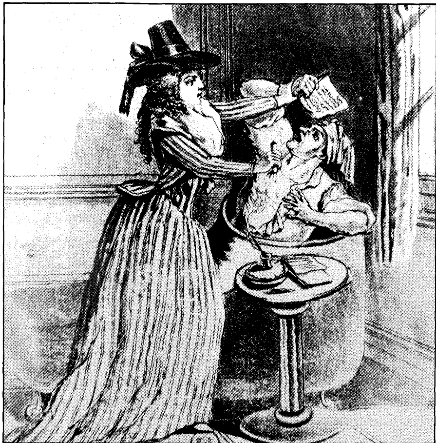
Marat is stabbed to death in his bath by Charlotte Cordey.

to sit in the market places and encourage the recruits with patriotic songs. The French treasury had been almost bankrupt before the revolution. The mounting costs of the war made things worse. The Jacobins paid their way with paper money, that is, money they had not got. The result as we all know nowadays was inflation. The revolutionary government answered by the Law of the Maximum, freezing prices and to a lesser extent wages. The Maximum was enforced by Terror. Many of those brought before the Revolutionary Tribunal were there not as traitors or aristocrats, but simply for infringing the Law of the Maximum. There has never been a greater test of the idea that you can get rid of inflation by controlling prices and wages. The attempt failed. Inflation stormed ahead until years later when Bonaparte resolved that the French state should live within its income.