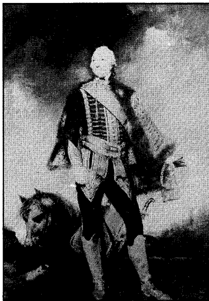
King Louis XVI.