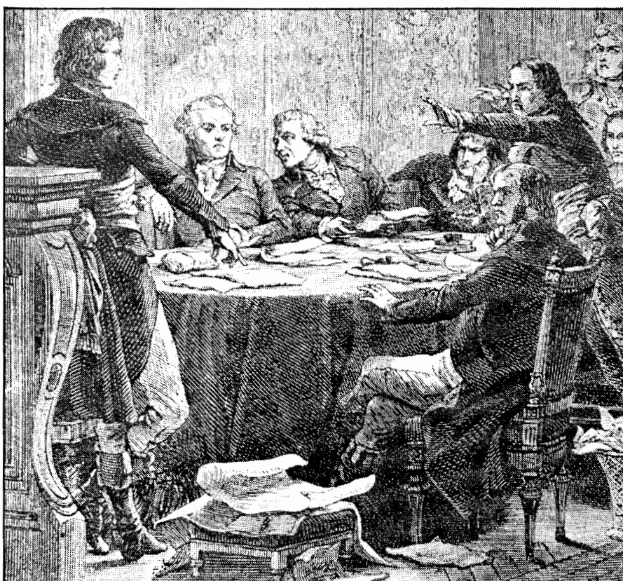
The Committee of Public Safety at work.

The French deputies of 1789 believed that they could make a clean sweep of the past. The monarchy was first defined by a constitution and then in 1792 overthrown. The aristocrats lost their privileges and sometimes their land, though many of them survived as wealthy landed proprietors. The Church also lost its lands and was put under the direction of the state. The traditional