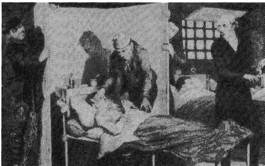
'Death of a convict in a Prison Hulk'. By George Cruikshank.

Transportation had a long history in Ireland even before the Act of Union in 1800. At the time when prisons were mainly holding stations for prisoners on their way to other punishments, flogging, branding or hanging, transportation became a merciful, cheap and convenient alternative to the gallows. It removed prisoners permanently from the community, helped to build up overseas colonies and offered profits to those able to sell convicts and their labour overseas. However, not all Irishmen agreed with this system. The patriot John Mitchell, who roused a furious Limerick mob against him in 1848 when he attacked Daniel O'Connell, considered the best way to deal with robbers, burglars and forgers was 'hang them, hang them ... I would ventilate the rascals in front of the county gaols at the end of a rope' 1 . Other contemporary Irish patriots, such as O'Connell, Thomas