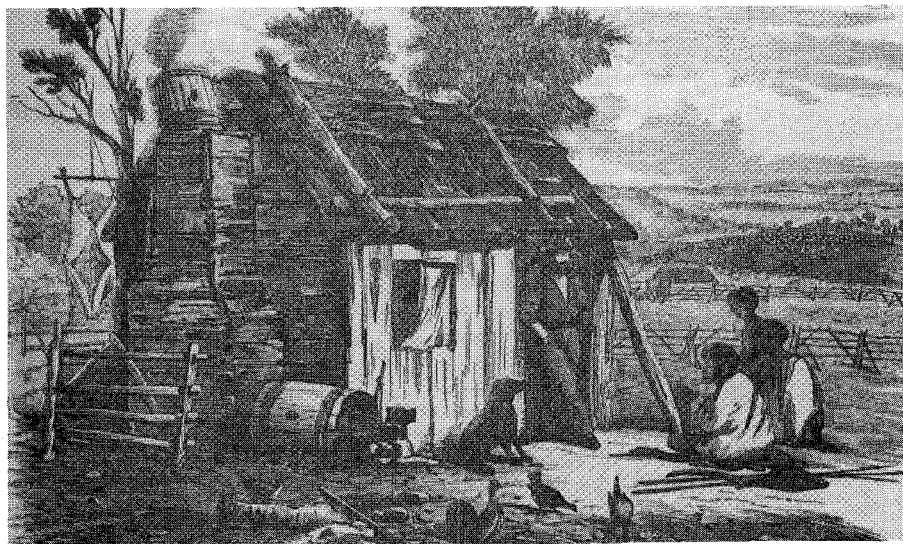
The convict Sheperd, in his bush stupor, meets the natives. This style of bark hut is typical of the outstations in which convicts lived.

Women, given a few months moral and technical training in Grangegorman, Dublin, before transportation, were considered more acceptable. In 1847, 22 Limerick women, double those of the previous year, were tried and transported without delay to Van Diemen's Land. In the next years, the respective numbers were: 1848 (50 men, 28 women), 1849 (68 men, 27 women), 1850 (17 men, 41 women), 1851 (4 men, 32 women), 1852 (1 man, 3 women). Thus in the final stages of transportation from Limerick to Van Diemen's Land, women outnumbered the men.