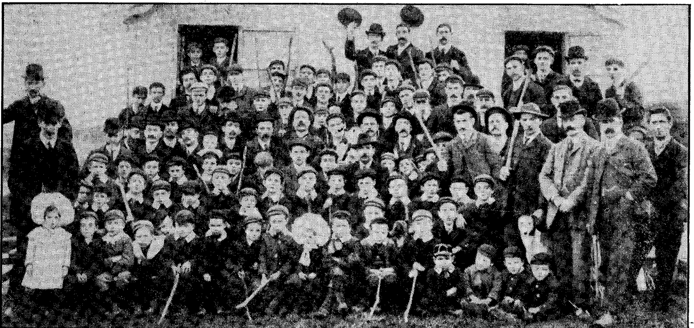
This well dressed group of wren-hunters, complete with wattles, was photographed outside the old Athlunkard Boat Club, before setting off on their day's outing in the early 1900s.

The itinerary of the journey over the traditional hunting-grounds never varied. The Bun Ard contingent always started off towards the 'Bottoms' remorselessly beating every hedge on the way. Moving downstream from the water meadows of the Shannon Fields, past the tail of Bealavunna, and the river draughts of Swan, Feehib and Poulahurra, the men crossed the Pike Bridge to the high ground of Athlun-