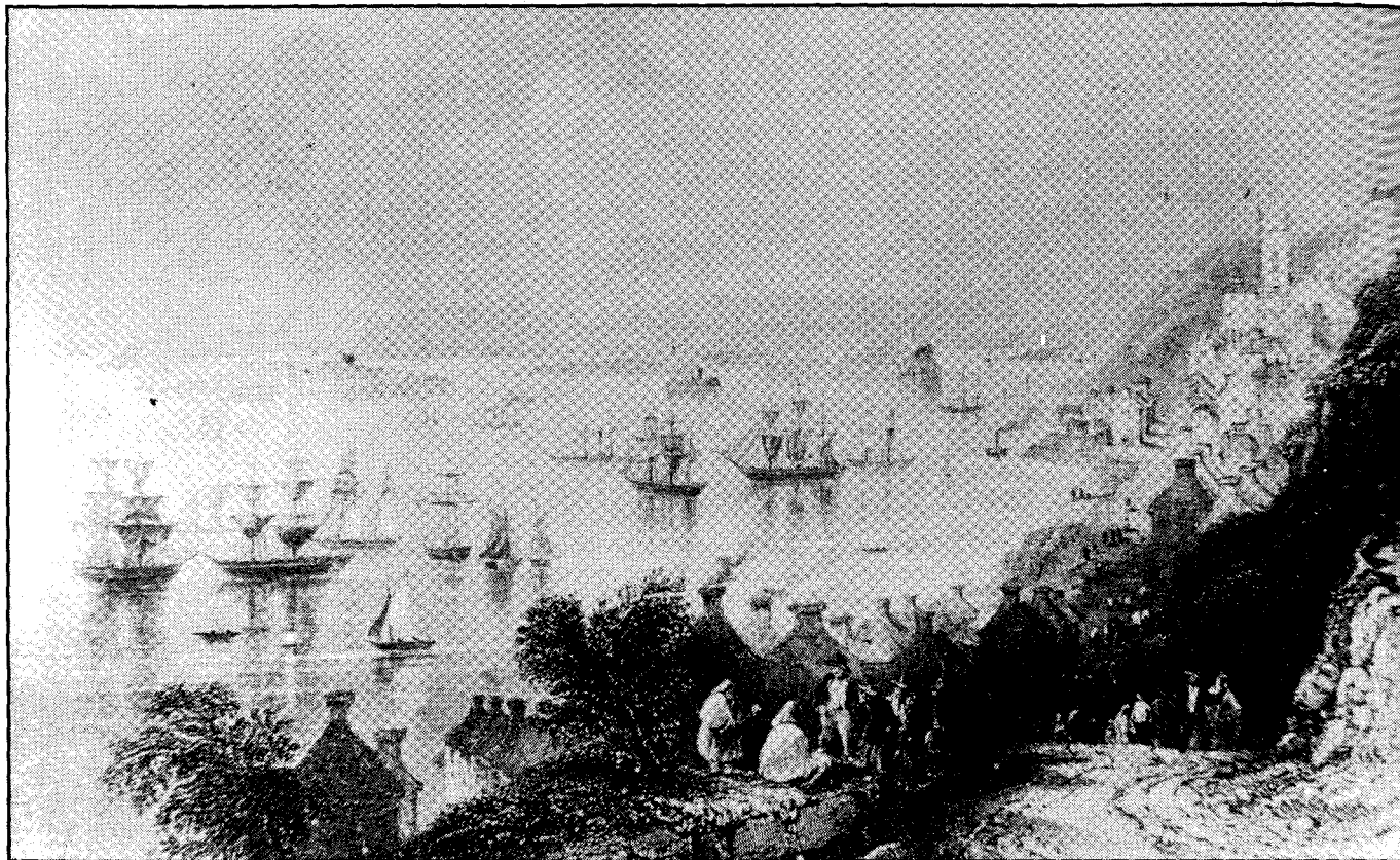
The harbour at Cork: mid-nineteenth century engraving.

chapters two and three deal with the prisoners and immigrants; four sees the Irish as 'Settlers and Unsettlers'; five deals with Irish nationalism; six focuses on rebels, and also examines attitudes to happenings in the Ireland of the early 20th century and independence era, and the last chapter – 'Australians' – recognises the absorption of those of Irish descent into Australian society and a consequent distancing from the old homeland. The author comments that 'By 1921 those of Irish descent in Australia had been taught the lesson that Irish politics was painful, embarrassing and damaging to them'. The Civil War in Ireland had its effects in far away Australia also, for we are told: 'As Irishman killed Irishman in Ireland, they also killed what remained of Australia Irish enthusiasm for Ireland's cause, whatever that was.'