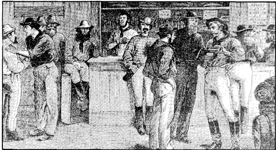
BUSH LIFE: INSIDE A TAVERN: 'The Queensland bush tavern is a terribly fascinating spot to the shepherds or stockmen who have led a solitary life for many months, drinking nothing stronger than tea'.

occasion by a turgid style, involving rather long, complicated sentences and seemingly endless adjectives – almost pretentious at times, e.g. 'Many of the first Irish emancipist generation were of this kind, semi-literate, with no understanding of principle, contradictory, factional, selfish, unpredictable...'; or 'The ideal Irish family, rural, humble, large, pious, reasonably prosperous, happily stable...' Not to mention, surely, the pièce de résistance , for when referring to literary efforts whose setting was old Irish Catholic Australia, such as the celebrated million dollar best-seller, The Thorn Birds , we get this thunderous comment: '...exaggerated to novelistic absurdity and fittingly mythologised into a saga of heat, dust, drought, bushfires and kangaroos, populated by stereotypes of clerics and brogues, passions and plotting' – one gets the feeling that the author derives a curious pleasure tying up his readers in such resounding prose!