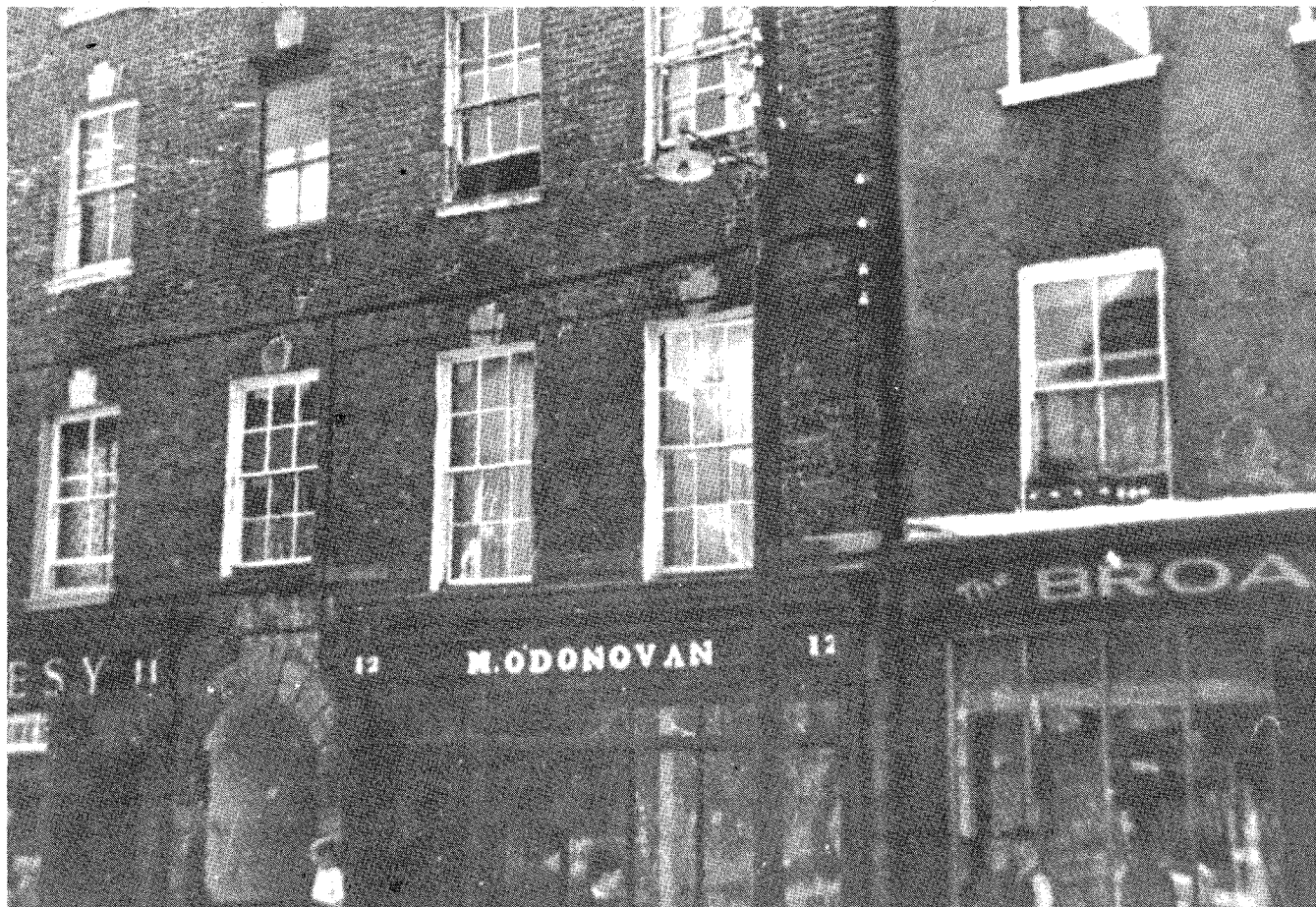
Broad Street, c. 1930.