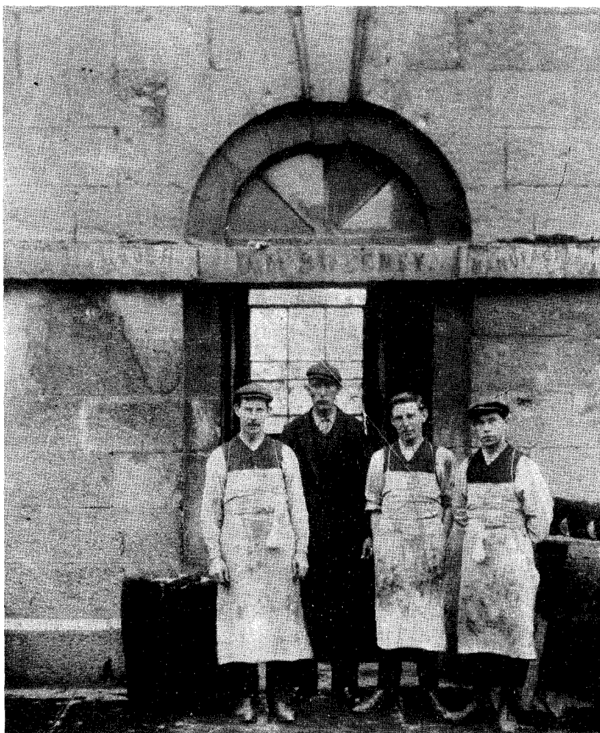
Four brushmakers outside McSweeney's Market House, C. 1910.

This situation is remarkable when one considers that in the mid-1820s an elaborate scheme was launched by the Waterworks Company to erect two large reservoirs at Gallows Green on the site of the old Cromwell's Fort; these contained 600,000 gallons of water which was pumped from the Shannon by means of a 40 horse-power steam