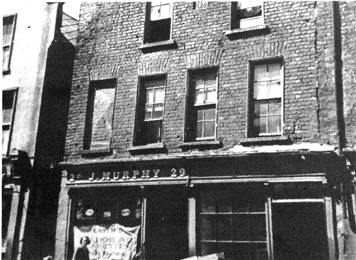
Murphy's shop, Broad Street.

Space was at a premium when the city walls were intact and room to live in was sorely limited, hence the cramped conditions in the warren of narrow, in-