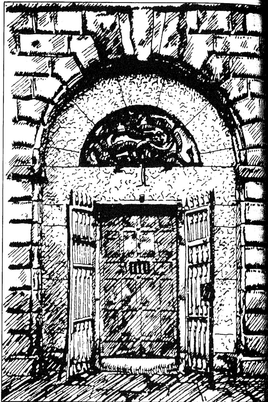
Kilmainham Jail doorway.

Affairs now turned from bad to worse, for the Anacréon was hit by heavy winds on the return journey to France and forced into the port of Bergen in Norway. Tandy and Blackwell feared that the British navy might capture them if they resumed their journey to France, so they decided to return by the overland route. The French consul in Bergen fitted them out with disguises, and Blackwell pretended to be an American, using the name of Mr. Blackfirst. He left Bergen, with Tandy, on 2 October, and set out for Hamburg which had for several years