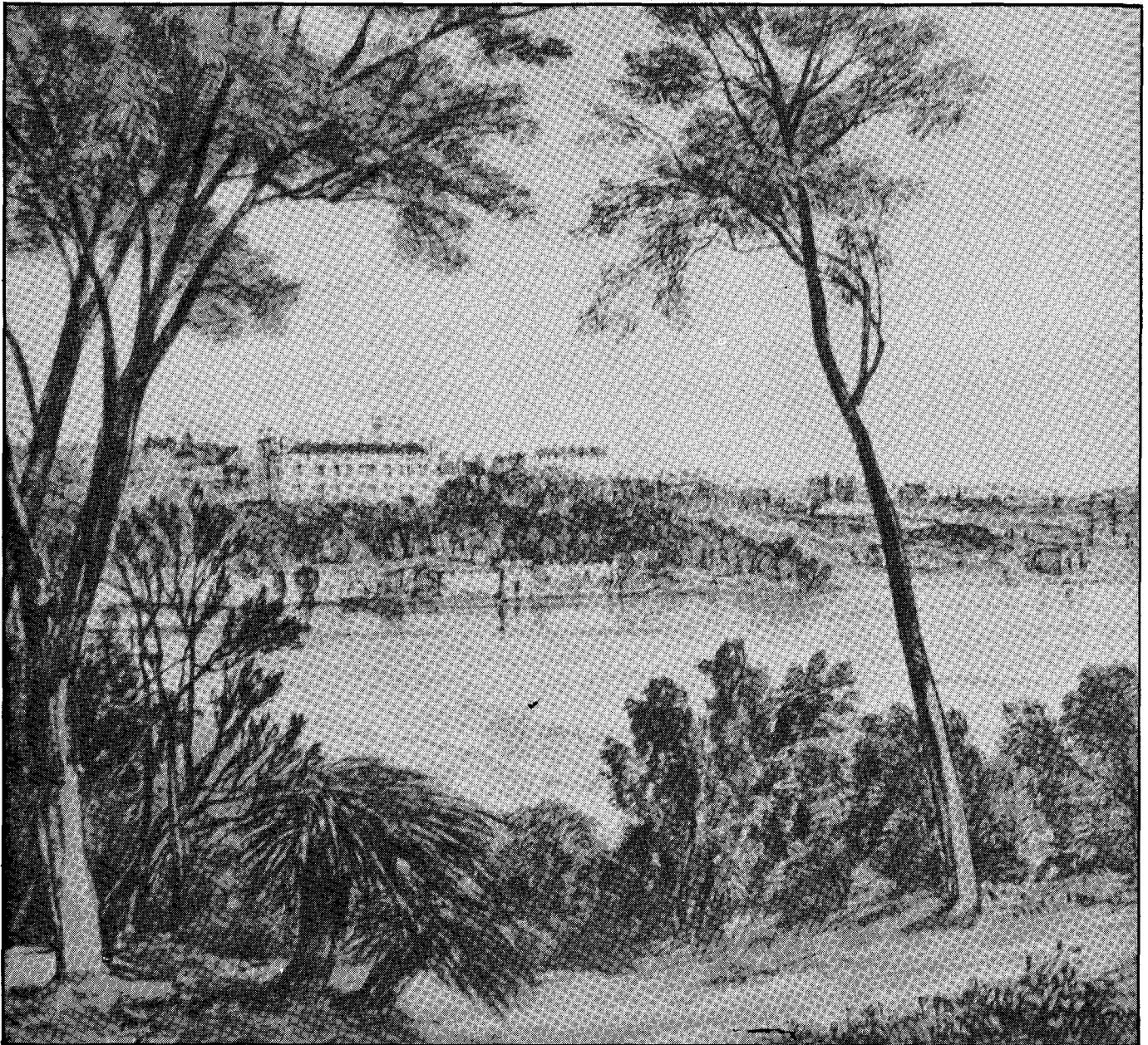
New Government House, Sydney, c. 1845.