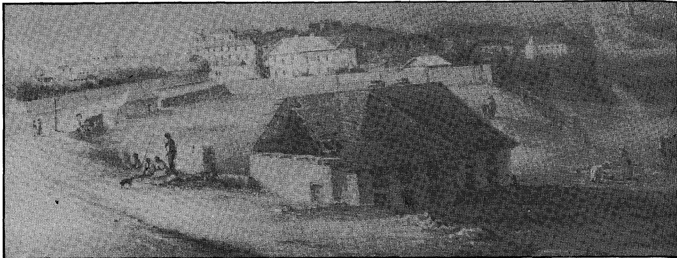
Bridge Street, Sydney, from a watercolour by C. Martens (The Dixon Galleries).

anywhere else'. A convinced federationist, chiefly because of his grasp of banking and currency, he was proposed by Parkes as a member of the 1891 convention, but was displaced by Dibbs. Pressure of business reduced his zest for politics and he lost his seat in 1894.