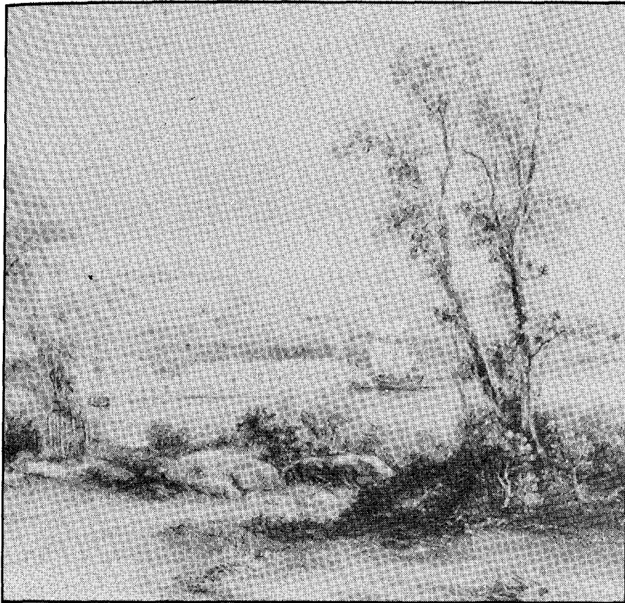
Sydney Harbour: west side of Sydney Cove and Dawes Point.