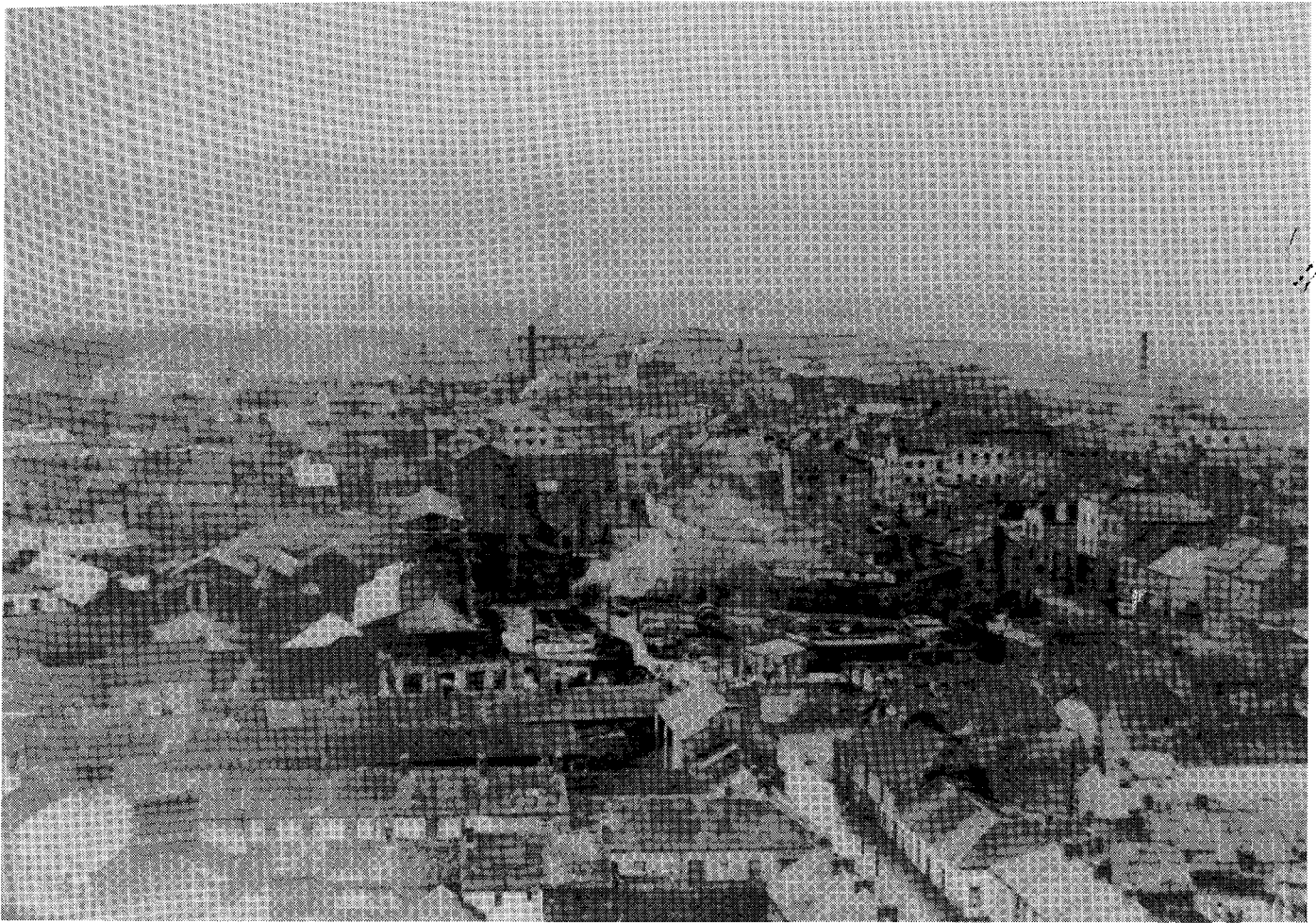
'He suggested there might be an opportunity to find work at home in Limerick'.