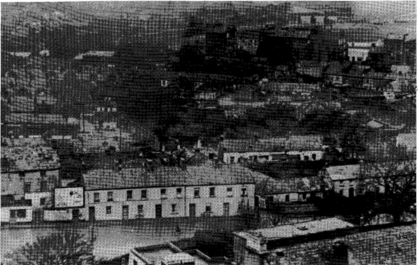
The Irishtown in the 1930s.

lodge: "You can stay here as long as you like. Everything in this house is clean, warm and dry - I insist that it is kept that way!"