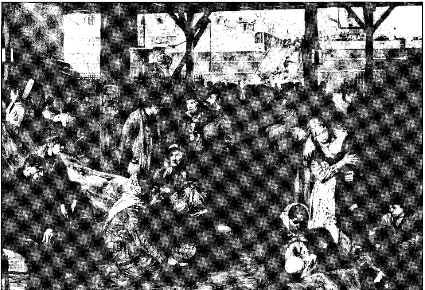
The interior of Castle Garden, New York, which was used as a reception centre for emigrants from 1856 until the Ellis Island facilities were opened in 1892.