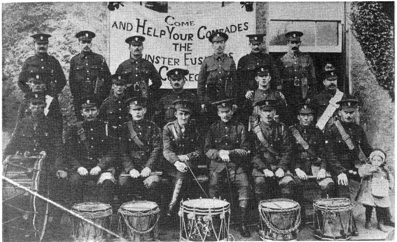
The Munster Fusiliers at Ennis, 1914.