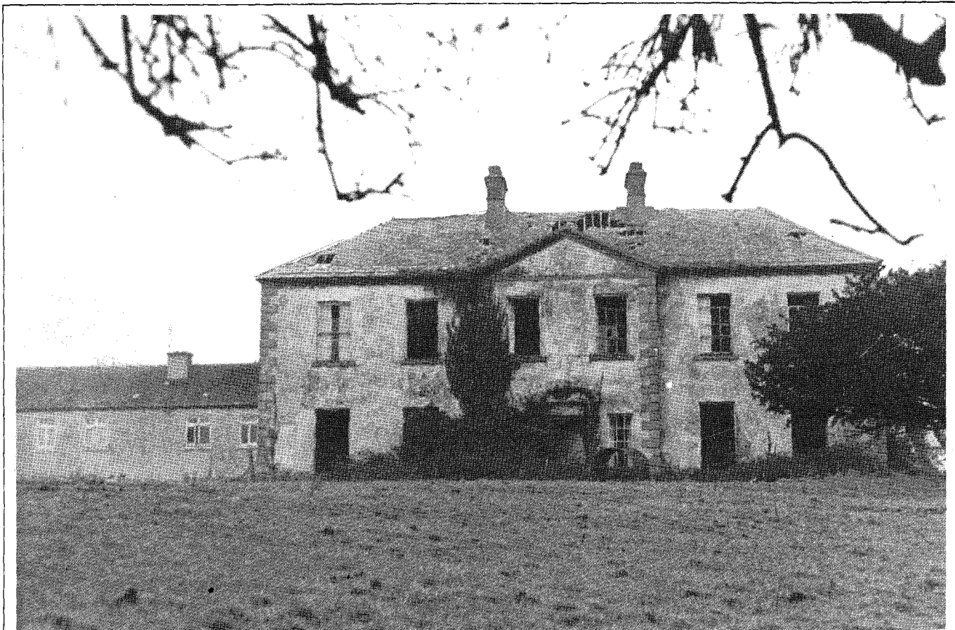
The ruin of Cooper Hill

Back at the barracks, I found that a War Office telegram had come