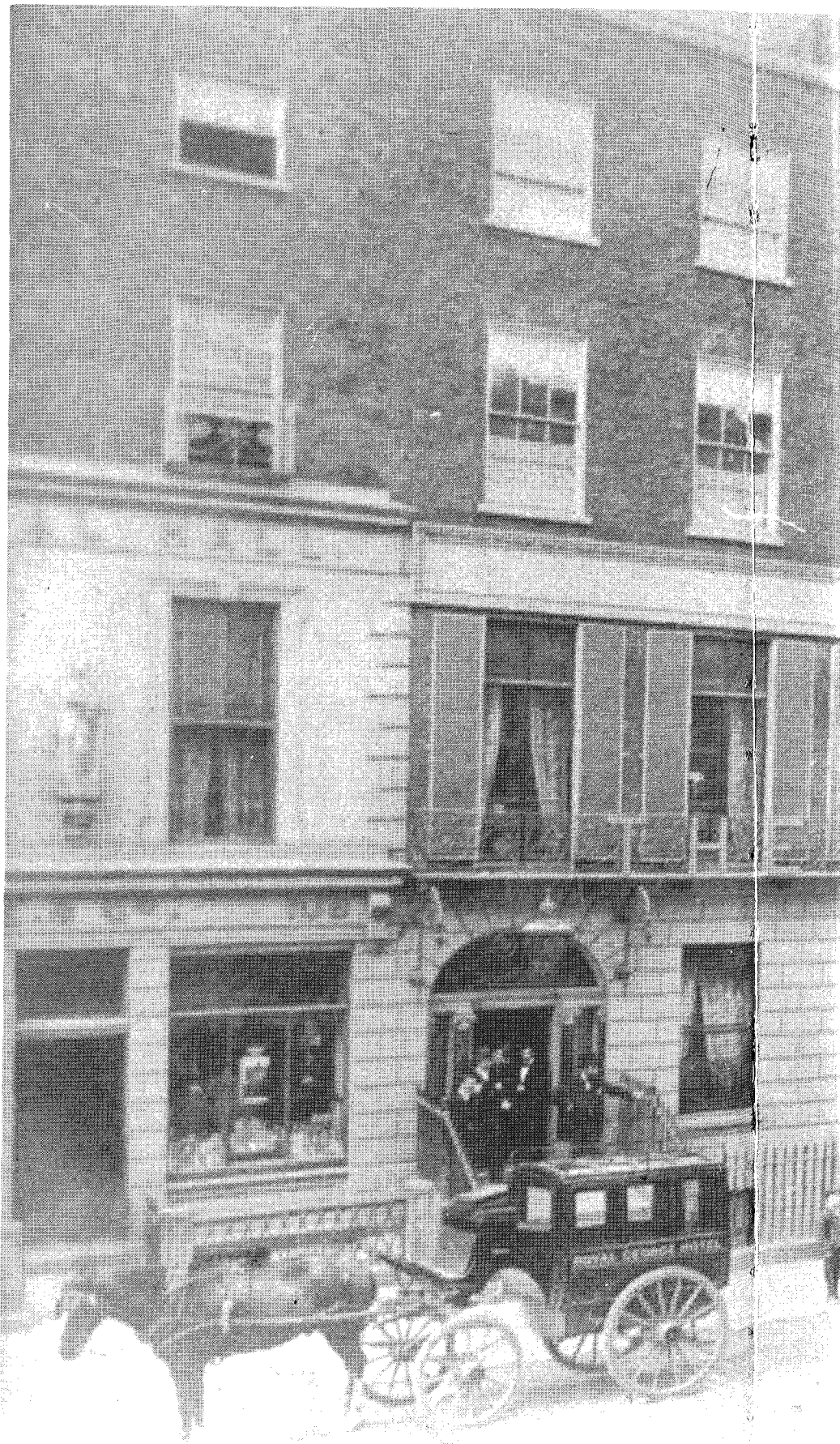
A turn of the century pict

(This was the day Frank's unit reached the front. They were in trenches near the village of Vailly on the Aisne for the next three weeks.)