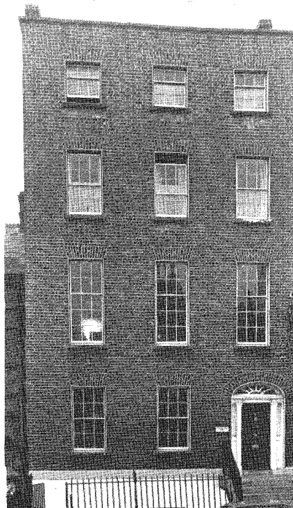
The Quinlan Street house where Christopher Isherwood attended school.

August 3. Germany has not only declared war on Russia but crossed the French frontier at three different points. It is impossible for England to be neutral. The fleet are to mobilize and the army are awaiting orders. All the men went through their medical exam today to be in greater readiness.