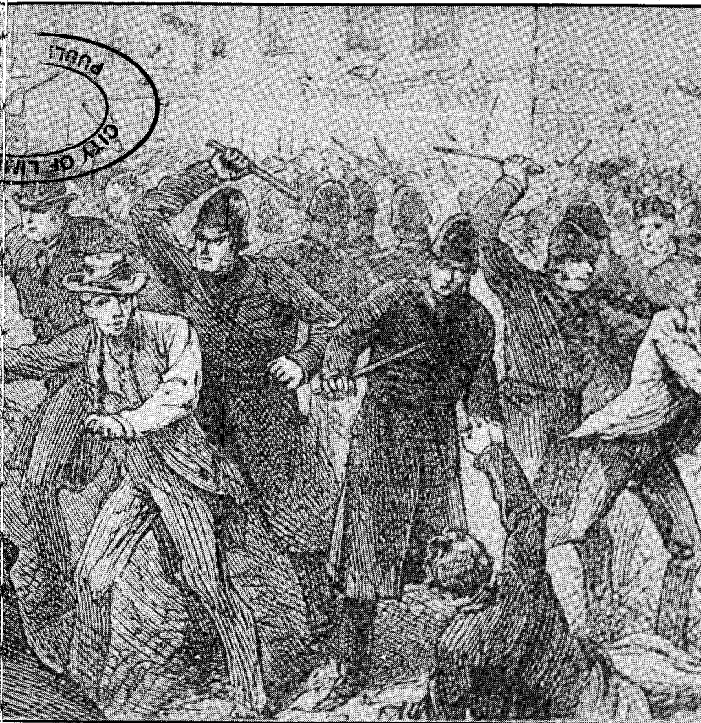
Disorder after election meeting in Limerick.

"... it was continually stated by their enemies in the Press that the nominees of Mr. Parnell were