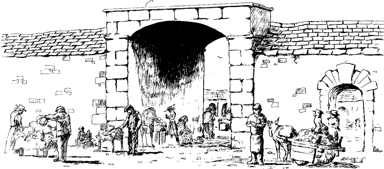
"In the market-place, mid the farmers and the corn stacks."

'Pshaw! you're prosy'. Am I prosy? Mark you then this sunward flight: I have seen this street and roof tops ambered in the morning's light, Golden in the deep of noonday, crimson on the marge of night.