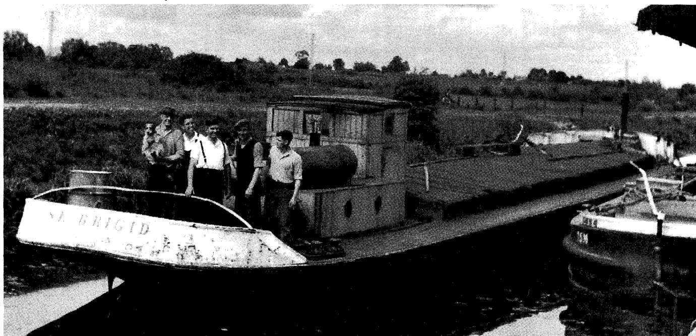
The crew of the St. Brigid c.1950

Maunsell family saw in it a chance to kick-start commerce in Limerick and to provide the legions of poor with some income to live on. Private investment was insufficient, however, and in 1767 an Act of Parliament established the Limerick Navigation Company with the sum of £6000 granted to Limerick Corporation for the purpose.