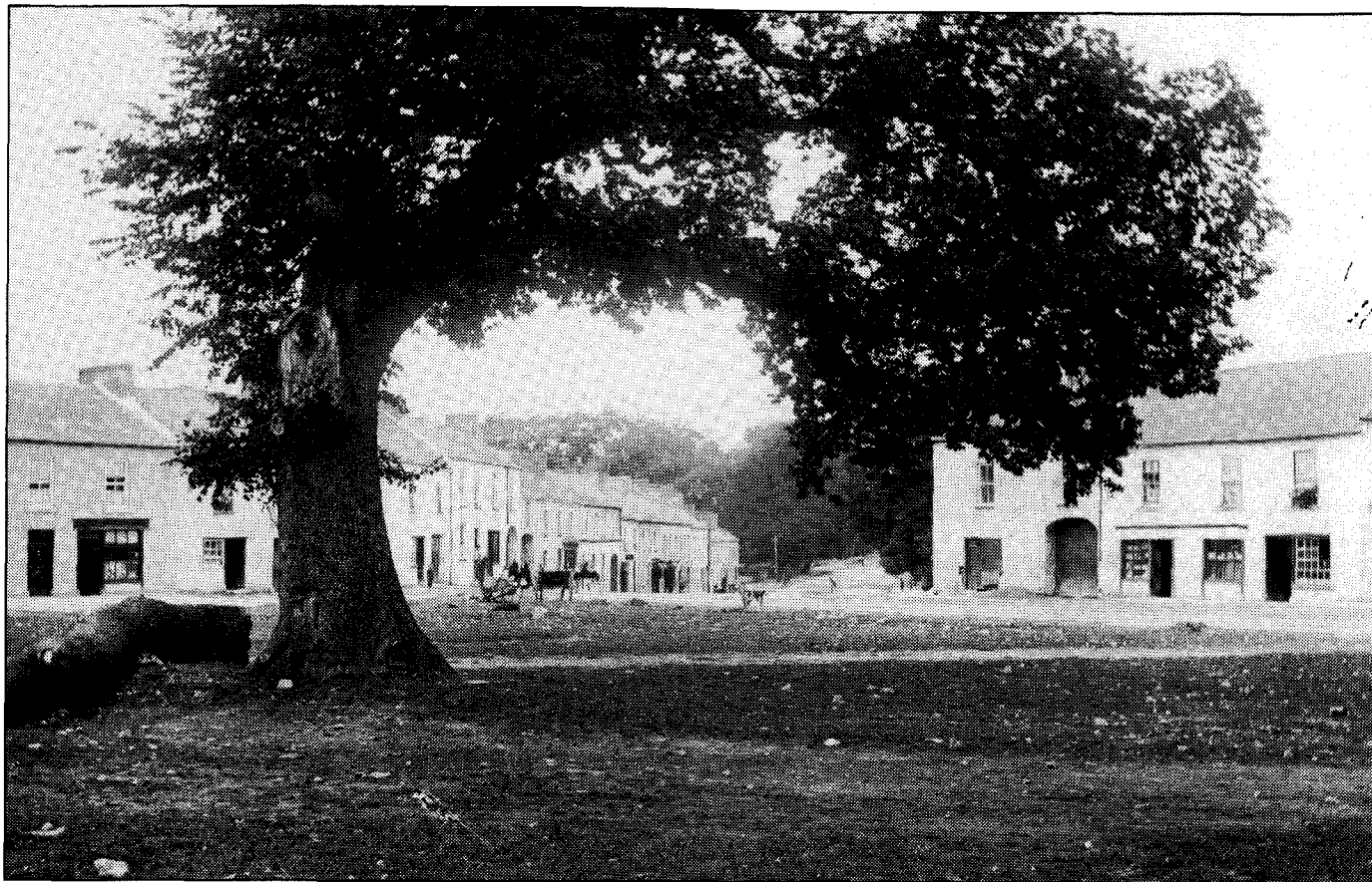
The Square, Adare, at the turn of the century.

later on, she expressed pleasure at my improvement in speech and manner - the little hooligan was being tamed at last.