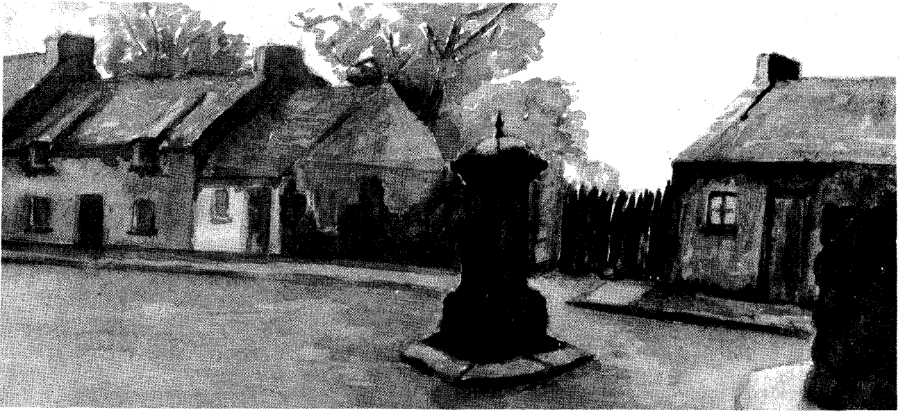
The pump at Pennywell (From a watercolour by Dorothy Stewart).