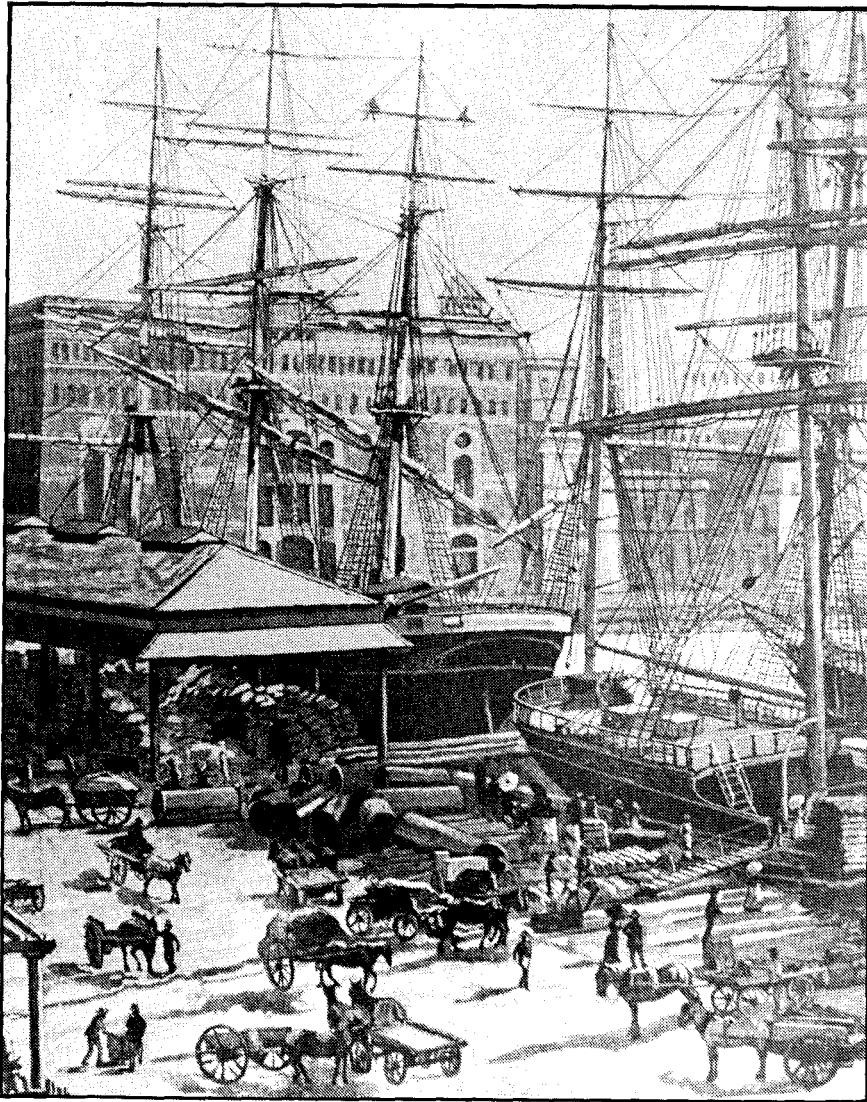
Circular Quay, Sydney, in the 1880s.