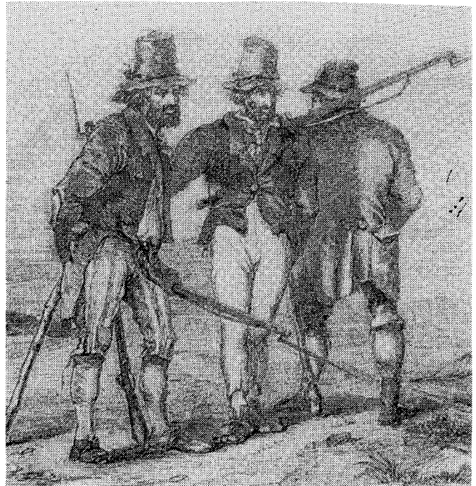
Three armed peasants waiting for the approach of the meal cart. Engraving, Pictorial Times, 30 October, 1847.

The prejudice of the people against the use of Indian corn, never in my mind very formidable, may now said to have passed away altogether in this part of the country. They do not eat it merely as the alternative of starvation, but I am assured that they prefer it to any other substitute to their accustomed food, and so much that few of the Committees now attempt to offer them anything else, and their sales of this meal are, with the exception of a few favoured districts, the sole resource of the poorer population throughout the south-western part of