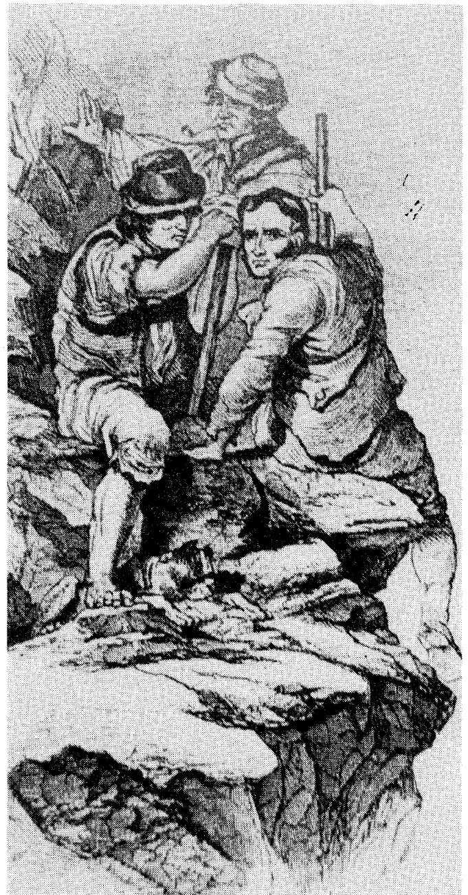
Three armed young men lie in wait. Engraving, Historic Times , 1 June, 1849.

A further question of deep interest is, whether or not similar assistance will be required in the ensuing year. Even should the potato disease not re-appear, it is generally anticipated that the coming crop must be deficient in quantity by reasons of diminished