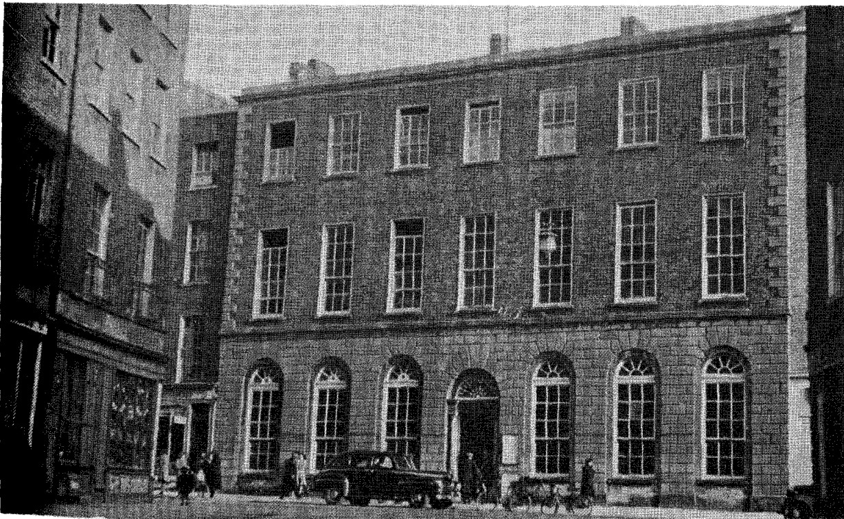
Georgian Limerick: The City Hall.

Another night it was a green rose I had been given which started brisk discussion in the lounge. One was for carrying it to England in damp moss, to strike ten days later. Another sat down to write to the head gardener at Powerscourt, who would know the best way to keep its