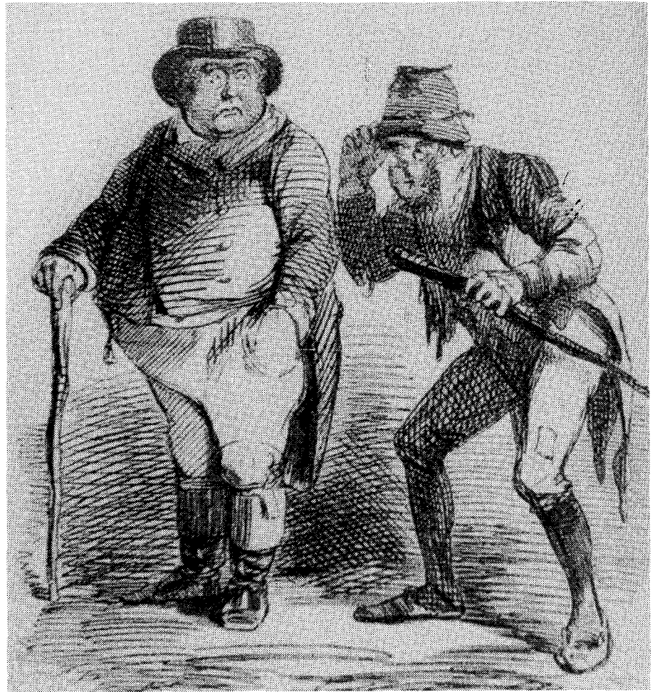
'Height of Impudence'. Caricature from Punch , 12 October, 1846. John Bull is accosted by a crude, hat-touching Irishman.

On 15 August, 1845, before the ravages of the potato blight were observed, Graham wrote to Peel expressing his anxiety that, 'no law will be found easy to feed 25 millions crowded in a narrow space when Heaven denies the blessing of abundance. The question always returns, what is the legislation which most aggravates or mitigates this dispensation of Providence?' (12) Graham's use of this terminology was more than a rhetorical device, as he was a man prone to apocalyptic alarms and pre-millenarian