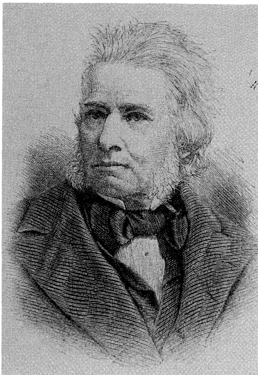
Charles Trevelyan, the most senior civil servant at the Treasury in London.

If the potato blight could be interpreted generally as a divine indictment of protection, and a warning to England delivered via the ministering agent of Ireland, it could also be seen as having specific reference to the structure of Irish society. Peel, in common with many English liberals, believed the state of Irish society to be fundamentally unsound, and held that the solution lay in a process of agrarian anglicisation. The causes of the country's social and economic problems were to be found in the inadequacies of its agricultural economy and in its archaic division of labour. He had long thought