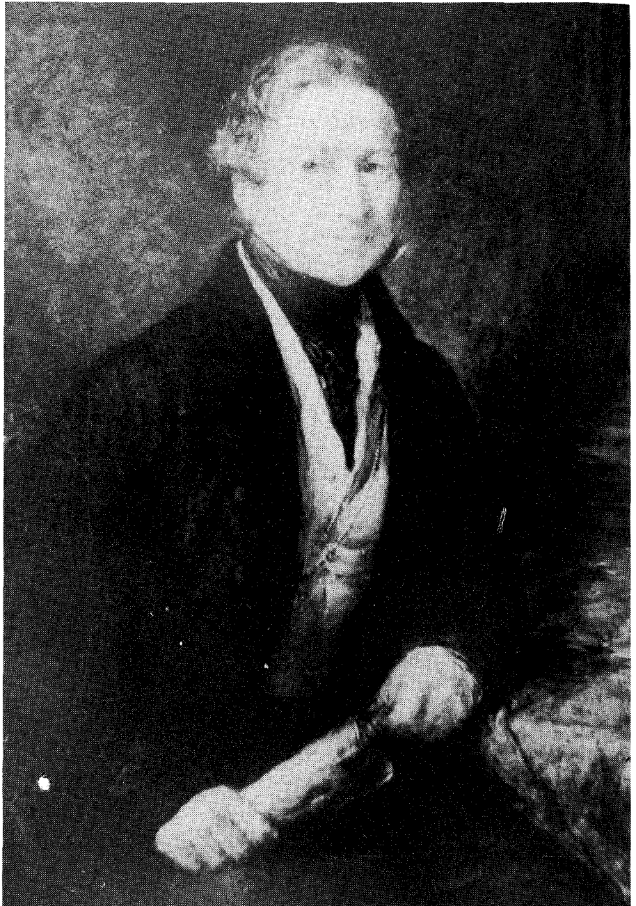
Sir Robert Peel.

It is not my intention to deny the importance of personal and party political manoeuvring, or of administrative