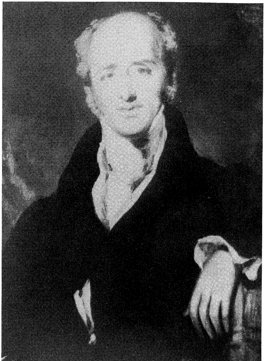
Lord Grey, the Colonial Secretary.

Trevelyan, for long the bete noire of many accounts of the famine, has too often been seen in isolation from his political context. It was the influx of a group of similarly minded men into office in 1846 that empowered him, and he is best regarded as a part of this 'liberal moralist' ideological bloc. Charles Wood, as chancellor of the exchequer and Trevelyan's direct superior, was the central figure, and drew support from Lord Grey and Sir George Grey in the cabinet. For Wood, the potato failure was the necessary harbinger of a 'social revolution in Ireland' which rendered any return to the status quo ante 1845 impossible as well as undesirable. It was