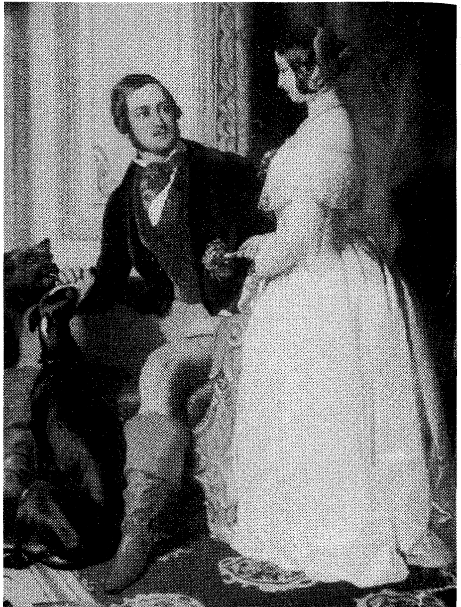
Queen Victoria and Albert, from Landseer's painting, Windsor Castle in Modern Times.