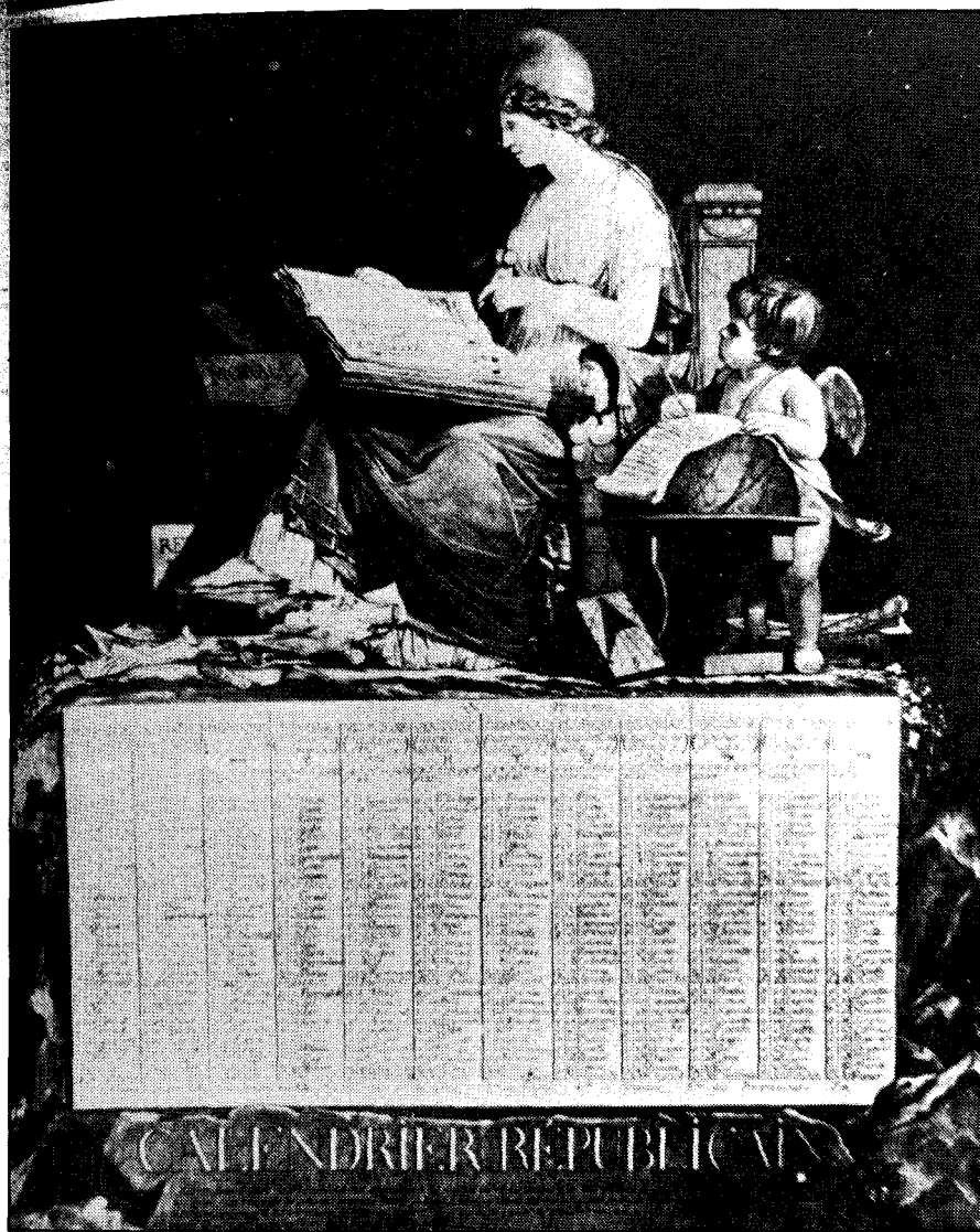
The Republican Calendar.