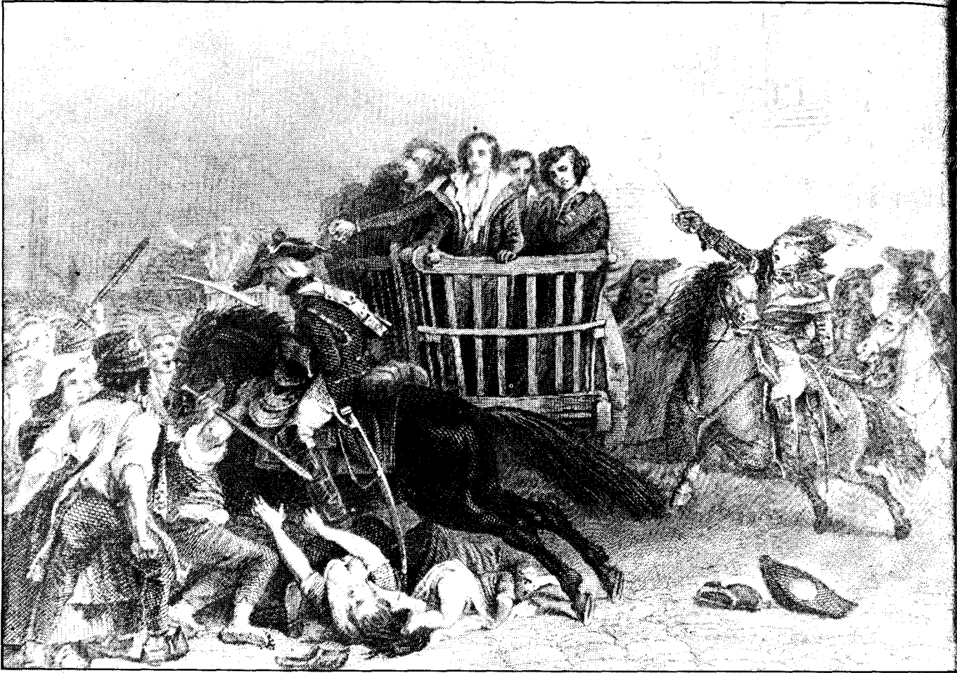
'To the guillotine'.

government. Liberty, equality, and fraternity may have been generally endorsed words, but the revolutionary decade remained a battleground of ideas.