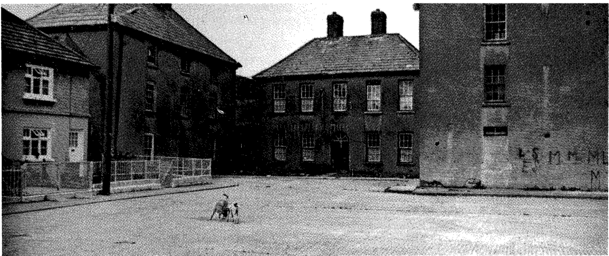
The Commanding Officer's house at the Castle Barracks.