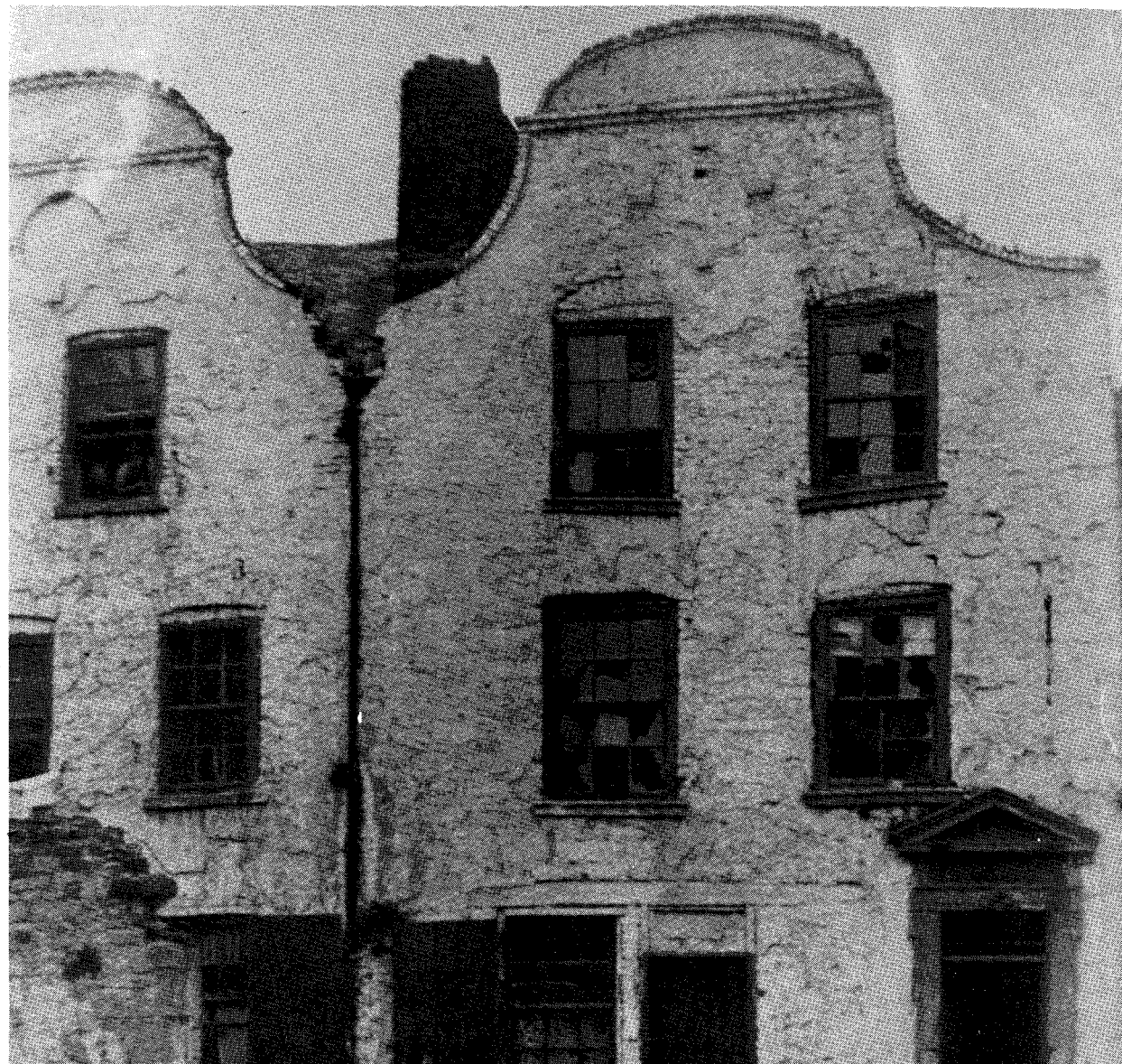
Some of the Dutch-gabled houses.