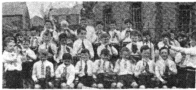
The St. Vincent de Paul School Band.

questing noses and pink eyes; the odd trip to the Lyric where I first saw King Kong... is it true that the missionary once began his sermon to a depleted congregation in the Dominican Church opposite, with the words, 'Ding-dong the church is empty, King-Kong the Lyric's full!'. ?