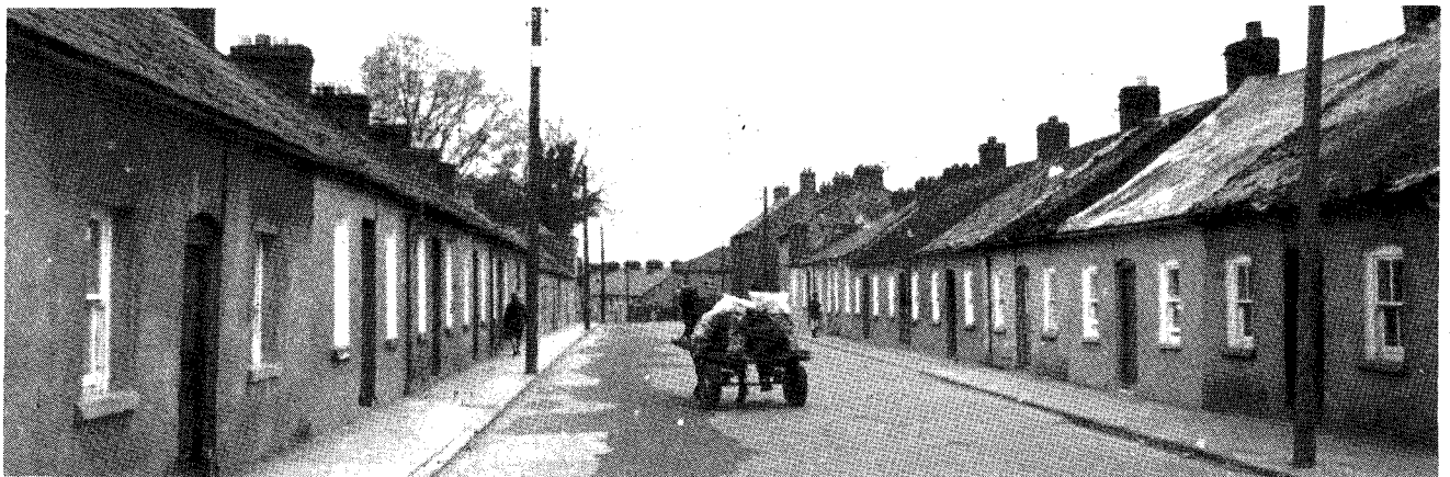
Thomondgate "of social joys".

The haunting smell of spices, dried fruit and bacon in Fitt's grocery shop (now sadly gone); the delight of watching the caged ferrets in the market, with their