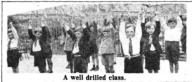
A well drilled class.