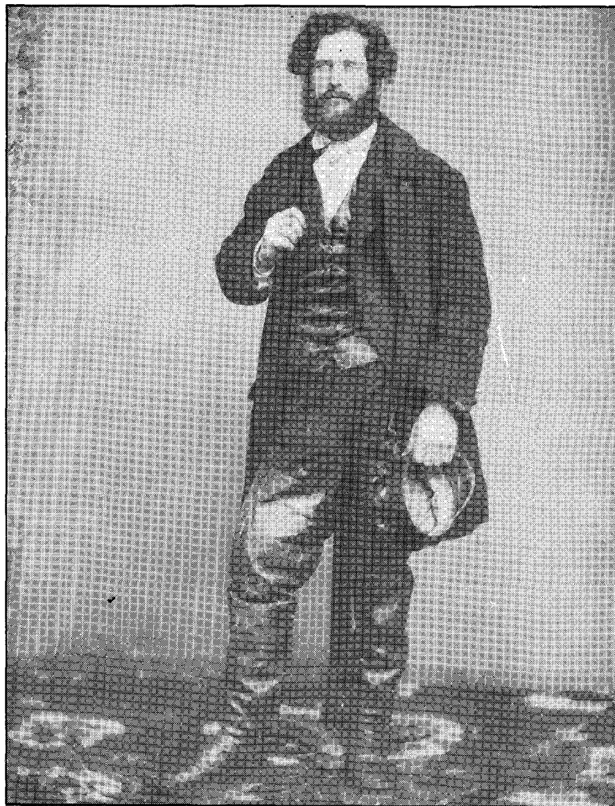
Terence Aubrey Murray in 1850. Murray (40) was then the owner of Yarralumla and Winderradeen, two large pastoral properties in southern New South Wales. He was also the district's first Member of Parliament. He was subsequently Speaker of the NSW Legislative Assembly and President of the Legislative Council until his death in 1873. He was knighted in 1869.