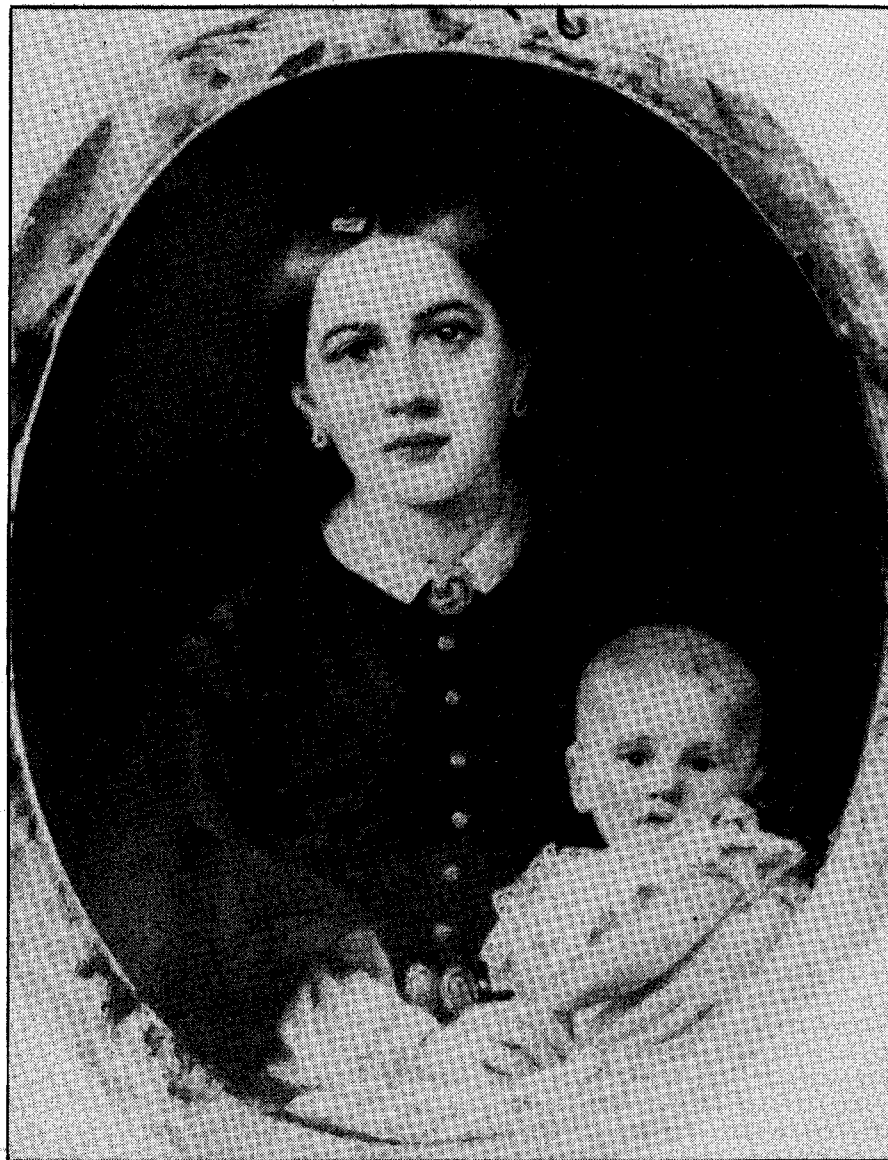
Agnes Anne Murray (nee Edwards), second wife of Terence Aubrey Murray, with their first child, John Hubert, in 1863. Hubert was to become Lieutenant-Governor of the Australian colonial territory of Papua from 1908 until his death in 1940.

The following year Terence made his first public speech from the steps of St. Mary's Catholic Cathedral in Sydney in support of an appeal for funds to finish the building. He was now a substantial landowner, because the Murray estates had grown to 20,000 acres on which Terence ran 13,000 sheep and 1,500