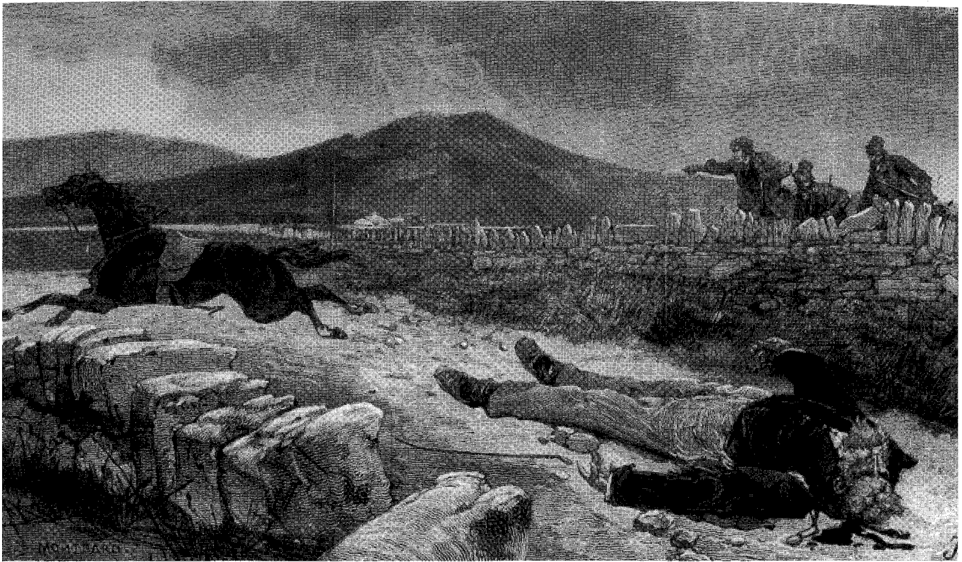
The shooting of a landlord from The Illustrated London News .

They searched the train in Oranmore as she was starting to Arklow, And every waggon, car, and coach, that went along the road. Connemara being remote they thought to that place I might resort. When they were getting weary they resolved to try Mayo. [In Ballinrobe they had to rest until the hounds were quite refreshed, From thence they went to Westport and searched it high and low. Through Castlebar they took a trot, they heard I was in Castlerock, But still they were deluded where I lodged the night before.]