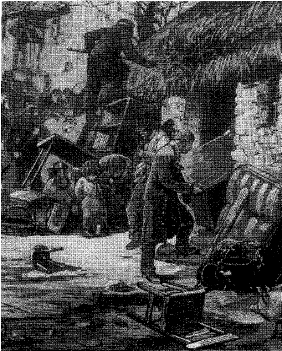
Eviction Scene, 1880 from The Illustrated London News .