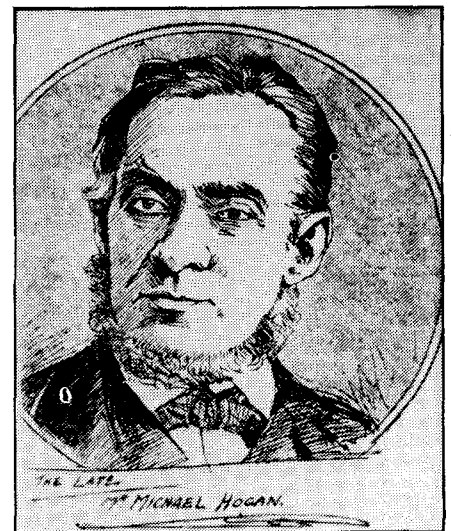
An early drawing of Michael Hogan, the Bard of Thomond.