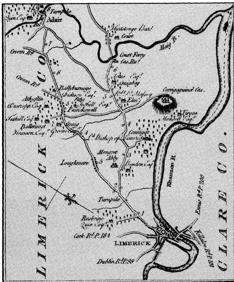
The roads along the course of the Shannon Estuary in 1778.

They were successful in getting another act and this apparently carried on the arrangement until 1831. During these years, the traffic on the road increased greatly. The Post Office introduced mail coaches and these had to