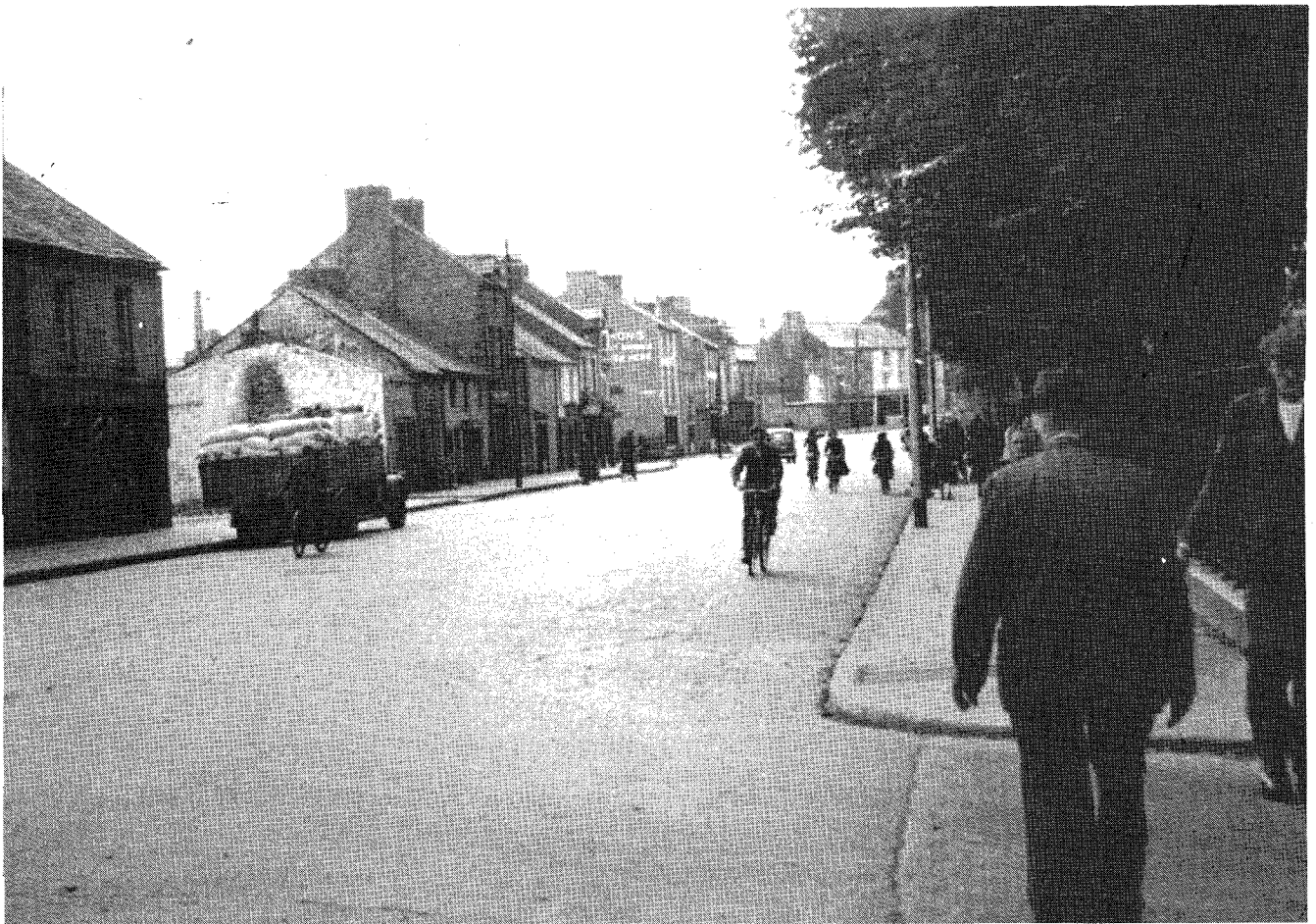
Edward Street in the 1950s.