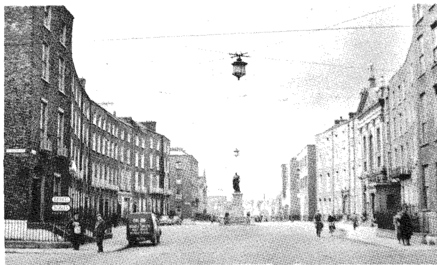
A 1950s picture of the Crescent.